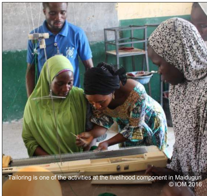
Tailoring is one of the activities at the livelihood component in Maiduguri