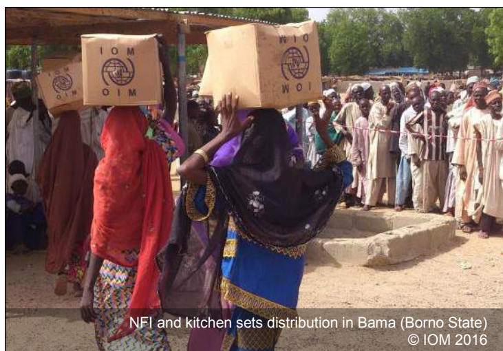
NFI and kitchen sets distribution in Bama (Borno State)

IOM carried out its biometric registration of displaced people in close collaboration with NEMA and SEMAs in Adamawa and Borno States and continues in Yobe State, through WFP funding, as part of its Cash Transfer Program. As of 30 June, 255,096 individuals have been biometrically registered, including 66,799 individuals (24,672 households) in Adamawa, 171,706 individuals (41,516 households) in Borno and 16,691 (3,026 households) in Yobe. The vast majority of IDPs who have been registered live in host communities where little or no assistance has been provided.