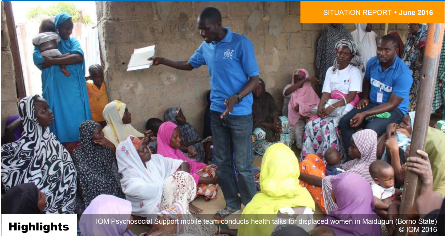
IOM Psychosocial Support mobile team conducts health talks for displaced women in Maiduguri (Borno State)