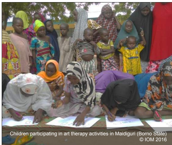
Children participating in art therapy activities in Maiduguri (Borno State)

In addition, IOM is collaborating with the Neuropsychiatric hospital in Maiduguri to equip the children therapy room in order to encourage and strengthen other forms of therapy apart from medication, especially to the children. The room will be finalized at the end of July.