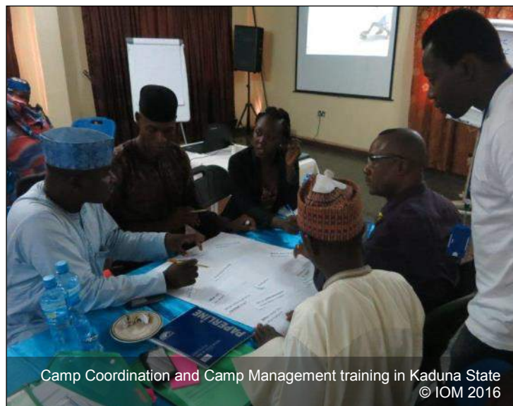
Camp Coordination and Camp Management training in Kaduna State

On 17 and 18 June, IOM provided 2,500 NFI and Kitchen kits to 10,265 IDPs in the recently accessible town of Bama (Borno State). The kits include blankets, mats, soap, buckets, basins, plates, cups and cooking pots. Furthermore, the construction of 283 shelters in Farm Centre, Bakassi and Gubio Camps is ongoing.