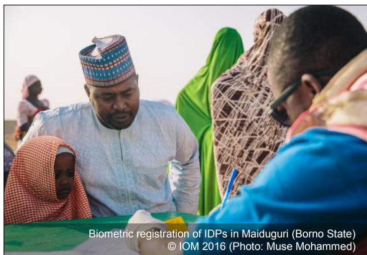
Biometric registration of IDPs in Maiduguri (Borno State)

IOM continued its pilot biometric registration of displaced people in close collaboration with NEMA and SEMAs in Adamawa and Borno States and has started in Yobe State, through WFP funding, as part of its Cash Transfer Program. During the month of April, 165,981 individuals have been biometrically registered, including 15,679 individuals (5,955 households) in Adamawa, 30,434 individuals (6,948 households) in Borno and 6,053 (1,272 households) in Yobe have been registered. The vast majority of IDPs who have been registered live in host communities where little or no assistance has been provided.