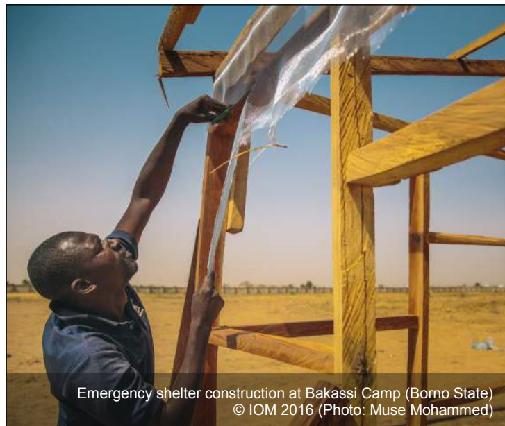
Emergency shelter construction at Bakassi Camp (Borno State)

In April, IOM started the construction of 200 shelters for 300 families of IDPs at Bakassi Camp to support the ongoing relocations of the displaced populations sheltered in schools in Maiduguri as Borno State authorities plan to reopen the educational facilities for children.