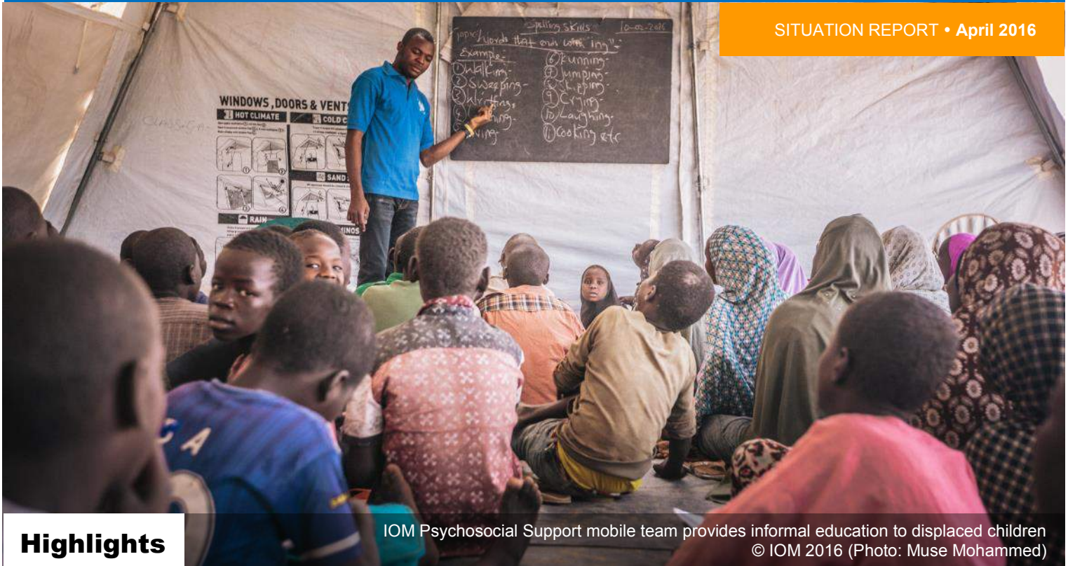
IOM Psychosocial Support mobile team provides informal education to displaced children