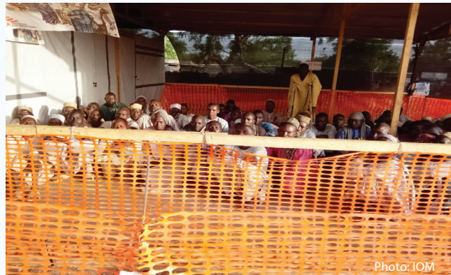
New arrivals from Cameroon, who arrived in Banki on March 27, awaiting screening before entry into the community