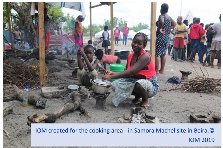
IOM created for the cooking area - in Samora Machel site in Beira.

The IOM MHPSS team is working on setting up the MHPSS programme in Buzi and Nhamatanda which have been identified as priority areas. The IOM MHPSS team aims to strengthen the referral system by linking the health posts that were damaged in the cyclone with the communities in the camps in the centres.