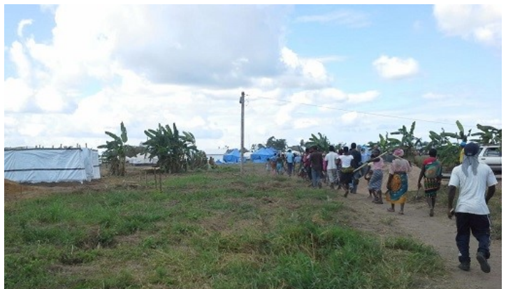
Guara Guara Biro 5, a new permanent settlement has been set up in Buzi. People who were working on preparing their plots are walking back from the permanent settlement to the accommodation site.

IOM WASH conducted assessments at Mandruzzi and Mutua, two new resettlement sites in Dondo. IOM WASH in coordination with OXFAM distributed hygiene kits in Mandruzzi and Mutua to coincide with IOM planned Shelter distributions. In addition, IOM WASH and IFRC are to install additional water tank/bladder at Samora Machel temporary site, since currently only 10,000 water bladders are setup and supplying 276 HH.