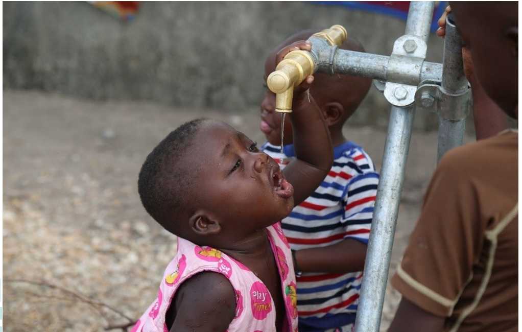
Child takes a drink from the water point, which provides safe drinking water for families at Samora Machel accommodation site.

IOM assisted with various shelter and essential household items in coordination with Shelter Cluster partners (17,054 HHs)