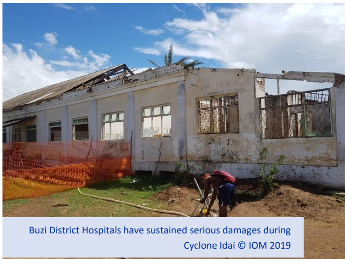
Buzi District Hospitals have sustained serious damages during Cyclone Idai

From 27 to 30 April, IOM's Health team undertook site visits to accommodation centres. In Sao Pedro Claver, the Migration Health (MH) team provided transportation and medicine to a patient (emergency case) with sciatica, and transported some analysis of TB suspected patients to Beira Central Hospital. In Samora Machel, the MH team provided transportation to transfer a TB patient who had developed new symptoms muscle paralysis and a mass on the back side) to Beira Central hospital, and is currently being treated by doctors. 30 April, In Picoco, the IOM MH team provided health education training on TB, the trainings were attended by 180 people.