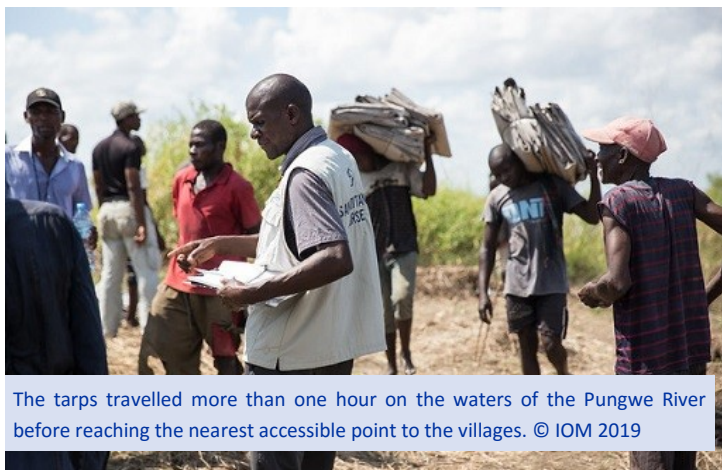
The tarps travelled more than one hour on the waters of the Pungwe River before reaching the nearest accessible point to the villages.

From 21 to 26 April, the IOM CCCM team conducted site profiles including the service mapping which is developed and under review. The Agua Rural site was closed on 30 April following the move of 130 families to the Cura resettlement site, now with 452 persons (156 HH) at Cura, Nhamatanda. The CCCM team identified one service provider for health on site, however, there is no water access, latrines, and sufficient number of tents on site. Mandruzzi, Dono remains with 272 households of which 194 are without shelter.