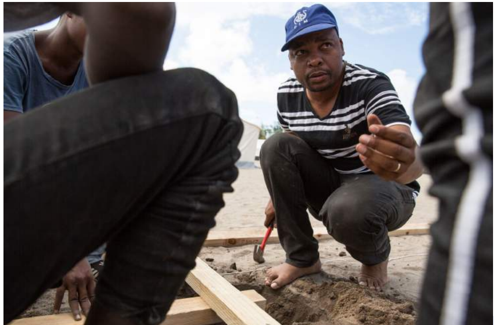
IOM staff members supported with the relocation of over 400 persons to the Escola Samora Machel temporary displacement site in Beira during the reporting period.