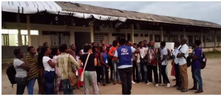
A training for 40 DTM enumerators was carried out near the Beira Airport on return intention surveys on 13 April.

On 15 April the Displacement Tracking Matrix (DTM) team released the of the multi-sectoral location assessments after collecting data in 67 displacement sites in Cidade da Beira, Dondo, and Nhamatanda districts from 02-07 of April. There were 52,745 individuals (12,019 households) across the 41 assessed displacement sites. 26 additional sites have also been assessed and the data and analysis will be available for the next situation report. IOM's DTM team also carried out needs assessments in 10 of the 22 displacement sites in Buzi. Significant gaps in service delivery inclusive of site management were in evidence throughout the area and primary identified needs ranged from food, shelter, and health services to a generalized lack of water and sanitation facilities. Shelter materials in particular were identified as a major need to ensure families can rebuild their homes. Affected persons who had evacuated from low lying areas where buildings and homes were completely destroyed will be included in government relocation planning.