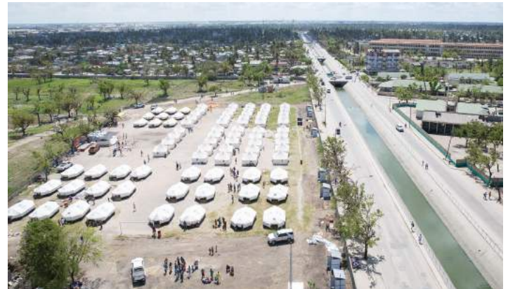
The Escola Samora Machel temporary displacement site on 11 April.

In support of local health authorities, IOM health teams assisted in the identification of persons with acute and chronic health needs residing in temporary displacement sites and provided referral to health facilities and return services where appropriate. This included 15 persons on Tuberculosis (TB) treatment who were referred to the National TB Programme and who will be supported to return home where they can safely complete treatment, be activity monitored and benefit from their social support at home. The majority of these persons originated from Buzi and were residing in temporary