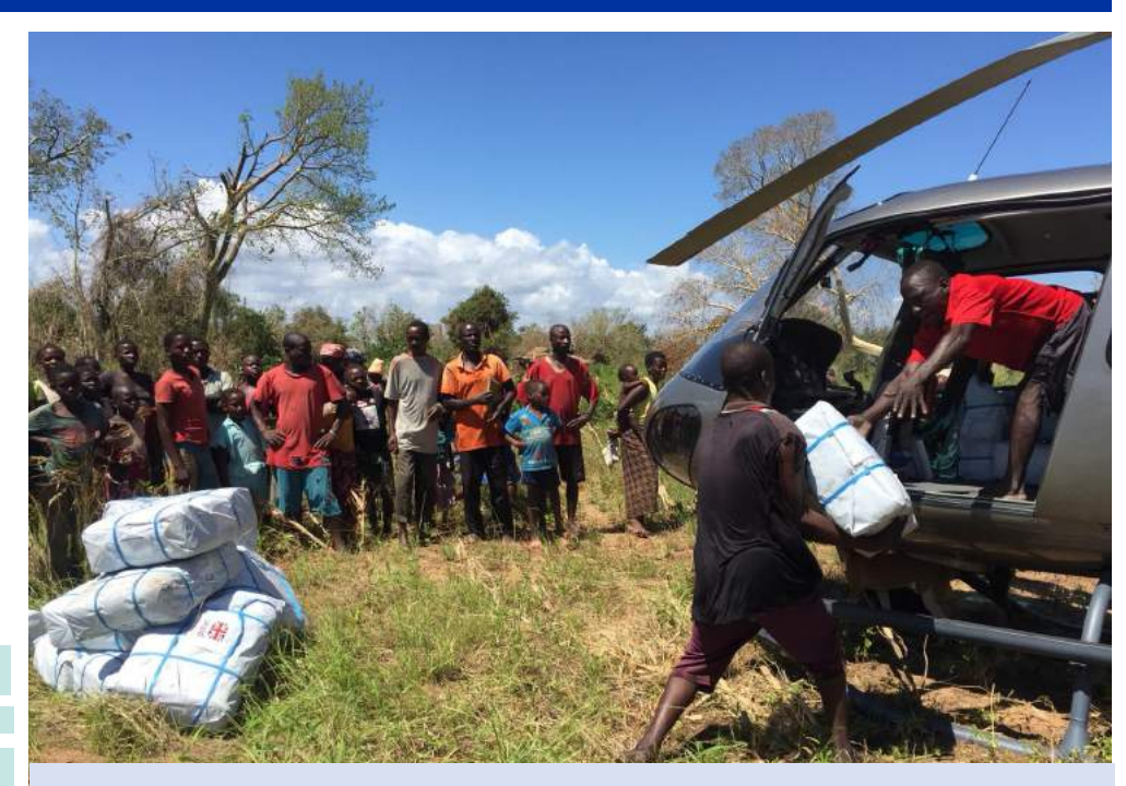
IOM assisted with the distribution of 36 shelter kits to cyclone affected families in Tica, an isolated community in Nhamatanda.

On 02 April, IOM's health team completed assessments of the Ifapa site's resident population's health requirements. The IFP Inhamizua site's residents were also assessed for health needs. IOM will seek to support the Inhamizua Health Centre (MoH) to provide outreach services to the IFP displacement site.