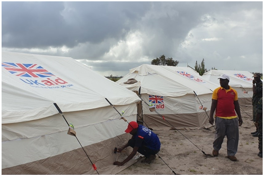
At the request of the INGC, IOM set up 30 family tents from UKAID at the Muavi relocation site in Beira.