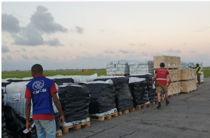
IOM and SDC staff take stock of newly delivered shelter kits in Beira

In total, IOM has received 205 family tents (including 100 from UKAID; 100 from Italy and 5 MPT from SDC), 12,000 tarps, 4,200 blankets, 1,000 solar lamps, and 500 shelter tool kits. IOM has distributed over 4,004 shelter NFI and tool kits via road distributions in close coordination with INGC. Mixed inter-sectoral distributions by air and road have been done in coordination with Shelter, Food Security, WASH and Logistics Cluster partners. In addition, IOM is co-sharing a warehouse in Beira and presently expanding office and accommodation space in the devastated city.