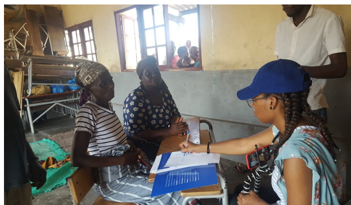
IOM interviews flood affected women at a displacement site in Mataouro. IOM is collecting demographic and intention data through the Displacement Tracking Matrix

The DTM team is also geo-coding the sites to ensure they are properly registered and mapped to allow for service extension by response partners.