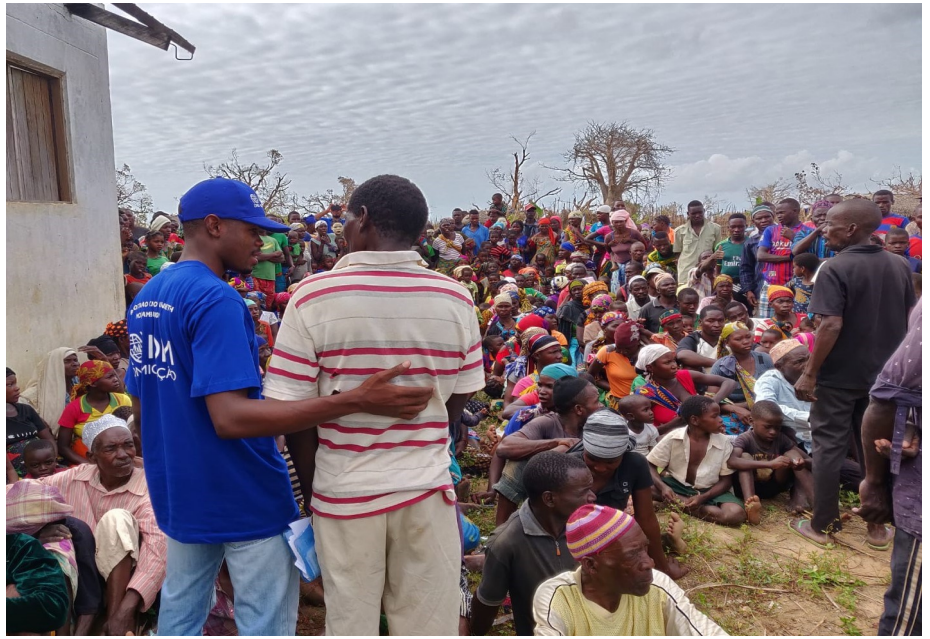
S-NFI teams supporting IDPs with NFI kits Macomia District, Cabo Delgado.

IOM assisted with various shelter and essential household items in Sofala and Cabo Delgado Provinces.