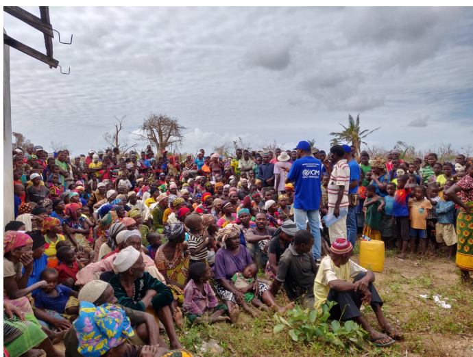
196 HH assisted with NFIs in district of Macomia, Cabo Delgado.

Shelter/NFI assessments are being conducted in several locations to monitor distributions carried by implementing partners and identify needs of the populations.