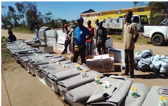
IOM Shelter-NFI teams assisting 2,060 households in Nanga A, Macomia Sede, Cabo Delgado Province.

In-kind materials are in transit coming from the Shelter/NFI and WASH Common Pipelines in Pemba. Since March 2019, the Shelter/NFI Common Pipeline has released more than 10,000 plastic sheets and 500 shelter tool kits for distribution in Macomia and 32 bales of blankets and 147 kitchen sets for the households in the Tratara Transit Centre in Metuge.