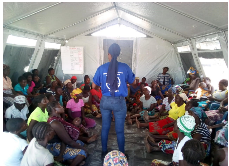
MHPSS team supporting training of community activists in Guara Guara, Buzi District, Sofala Province.

In Buzi District, IOM's MHPSS team participated in the training of community activists, facilitated by health personnel aiming at coordinating referral mechanisms. The team also met the psychiatrist of Buzi health centre to discuss IOM's activity plan in the area of MHPSS and agree on the referral of patients. In Guara-Guara around 100 women attended the session.