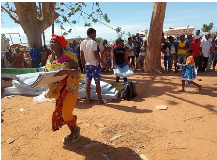
IOM Shelter-NFI distribution in Mucojo Sede aldeia, Cabo Delgado Province.

As of 15 June, IOM assisted 7,193 households with shelter and NFI support, including distribution of 5,535 tarpaulins, 296 blankets, 294 kitchen sets, and 110 toolkits. Through the Shelter Common Pipeline, IOM has supported partners in the distribution of 8,079 tarpaulins and 1,528 mosquito nets. IOM organized a tarpaulin distribution in Macomia District, Cabo Delgado Province on 10 June (Mucojo Sede aldeia) and 14 June (Runho, Nambo and Nagulue aldeias) where 2,106 families were supported with Shelter-NFI materials.