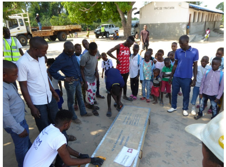
IOM distributed tents in Taratara transit camp, Metuge District benefiting 147 households, Cabo Delgado Province.

relocation process of the families living in Muinde host community. The DTM unit is conducting the first round of baseline assessments in eight districts (16 localities) of Cabo Delgado Province to gather information on the number of households affected by shelter damage and the number of people who have left their localities or have returned.