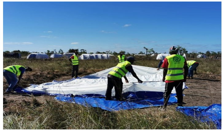
IOM providing and setting up family tents in relocation sites. Sofala Province.

Furthermore, IOM supported the relocation movement of 55 households from Piccoco accommodation site to Savane relocation area in Dondo, Sofala Province.