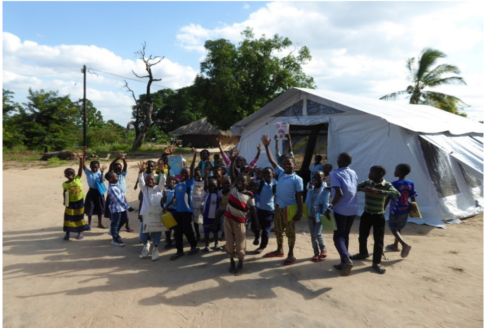
IOM S-NFI teams supported 147 cyclone-affected families in Taratara transit camp with tents including a tent to support continuation of classes for schoolchildren. Metuge District, Cabo Delgado.

assisted with various shelter and essential household items in Sofala and Cabo Delgado Provinces by IOM.