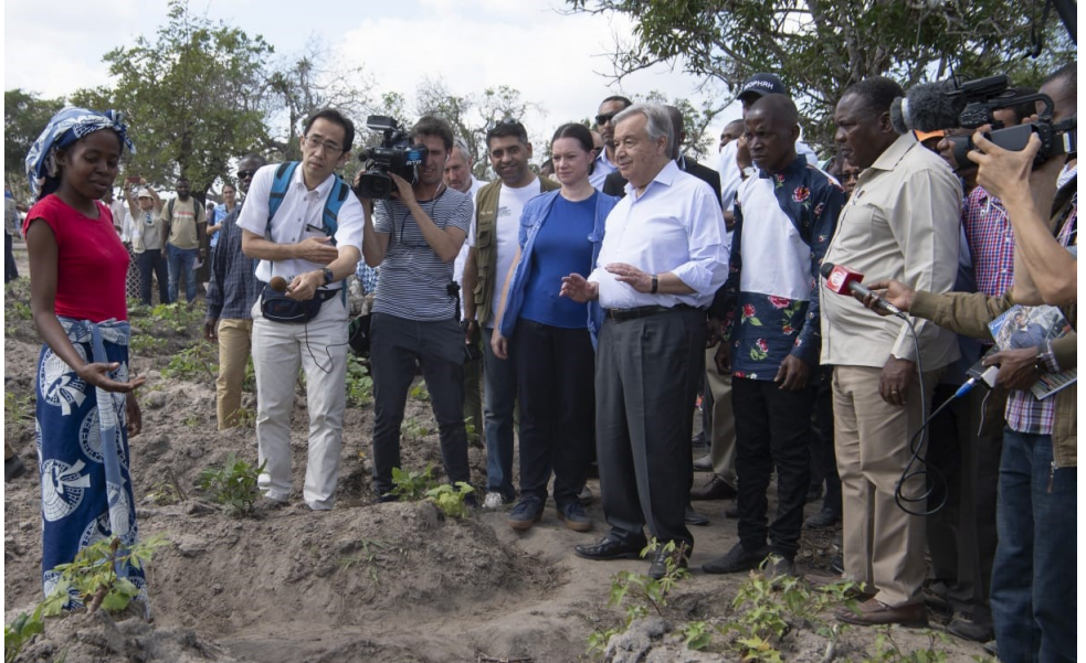
UN Secretary General António Guterres, during his visit to cyclone affected areas in Sofala province on 12 July

assisted with various shelter and essential household items in Sofala and Cabo Delgado Provinces by IOM.