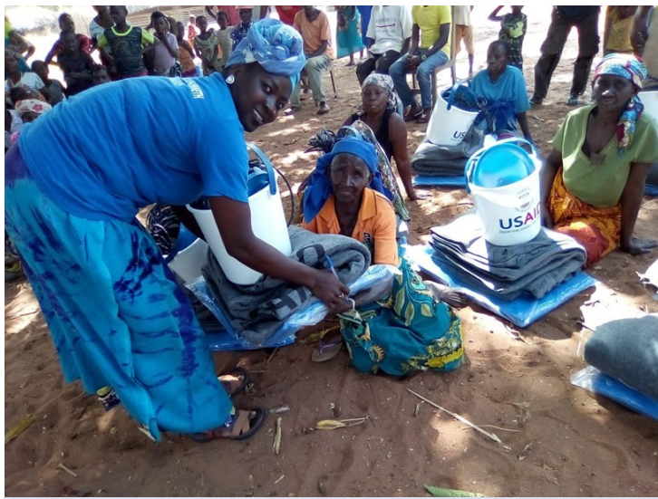
IOM's shelter team delivered tarpaulins, shelter toolkits and blankets to 1,560 families in Meluco District

IOM has assisted 37,212 households in Pemba, including through the distribution of 34,880 tarpaulins, 4,316 buckets, 34,673 blankets, 1,387 kitchen sets, 7,830 mosquito nets, and 1,164 toolkits.