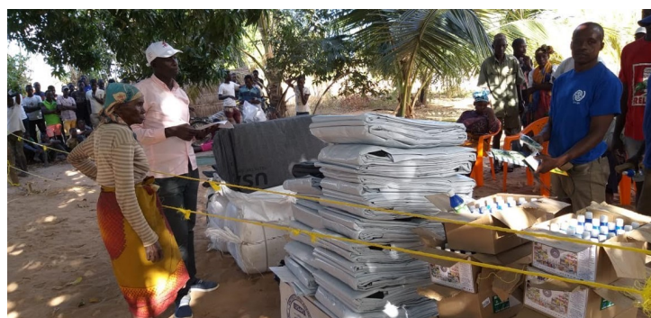
IOM realizing a distribution in the village of Natuco (District of Mecufi).