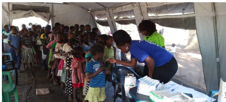
IOM and the Ministry of Health's mobile team provide vaccination and deworming in Chingamide Resettlement Site, Buzi District on 11 July.

The MHPSS team in Savane and Mandruzi (Dondo District) and in Guara-Guara (Buzi District) reached 195 people with mental health psychoeducation and health counselling services on epilepsy, anxiety, enuresis, drugs, and early pregnancy. In addition, 110 people benefitted from psychosocial support and nine patients have been referred for further specialized mental health support.