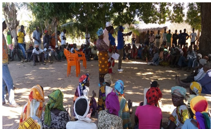
IOM staff explaining the dynamics of the distribution and the vulnerability criteria applied to the lists before the NFI distribution in Sassalane (Mecufi district) .

The Provincial Health Directorate (DPS) and UN Agencies requested the creation of an action plan to galvanize recommendations into concrete actions. Given the cross cutting nature of the MHPSS assessment, the results will also be shared with all other clusters to disseminate to humanitarian partners and the provincial and national governments.