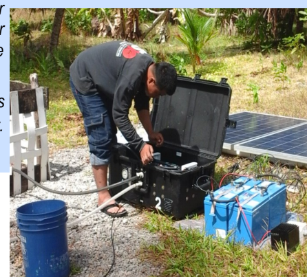
A 360 gallon per day RO unit on Namu Atoll @IOM Micronesia 2016

IOM's activities are funded by and conducted in partnership with the following generous donors: