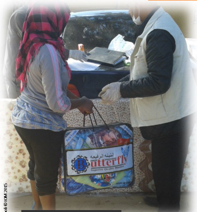
Distribution of NFIs to IDPs, needed to prepare them for the cold season.