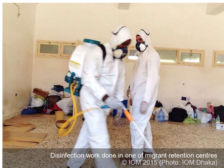
Disinfection work done in one of migrant retention centres

During the month of October, IOM accomplished the clean-up and disinfection of three migrant retention centres. IOM was working with its partners to improve the sanitary and living conditions in the centres in Surman, Musrata and Al-Qwea. The clean-up work started in the 2nd week of October, during which several site visits were organized by IOM's implementing partners, together with the contracted company. After the disinfection operation had been completed, a training on how to maintain good sanitary