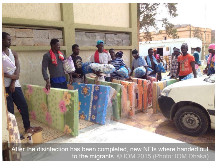
After the disinfection has been completed, new NFIs were handed out to the migrants.

Brochures with tips on how to carry out facility cleaning and maintain good sanitary conditions, as well as personal hygiene, were distributed to the migrants and staff in the centres. After the disinfection was completed, a full set of