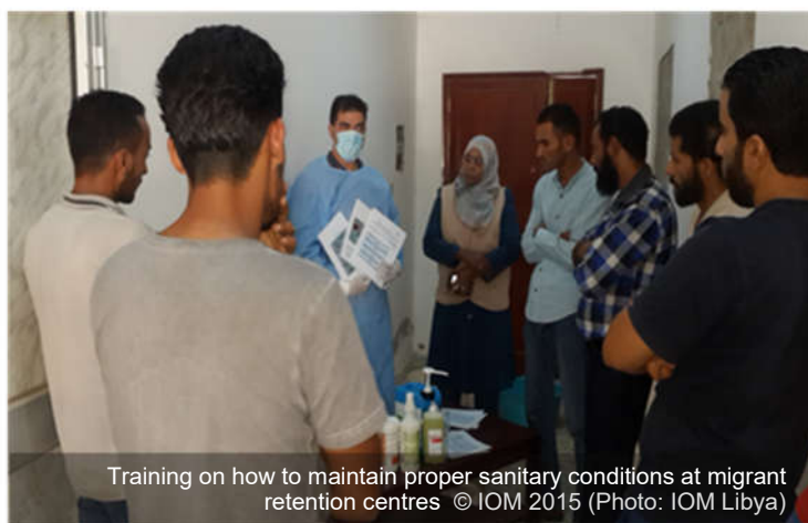
Training on how to maintain proper sanitary conditions at migrant retention centres

IOM organized the monthly coordination meeting for its implementing partners between 18 – 19 October. Five local NGO representatives attended the meeting to discuss the progress of intervention activities carried out inside Libya. Major challenges and future plans were also discussed to help feed into the strategic planning of future operations.