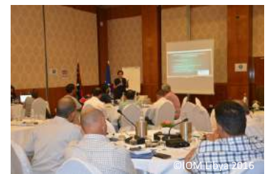
Participants during the health care assessment training, here with International Medical Corps.

The main objective of the training was to support IOM migration management counterparts in the field of promoting the health and welfare of migrants who often leave unprepared for their journey. They often lack food and water and find themselves in vulnerable situations with little access to proper health care.