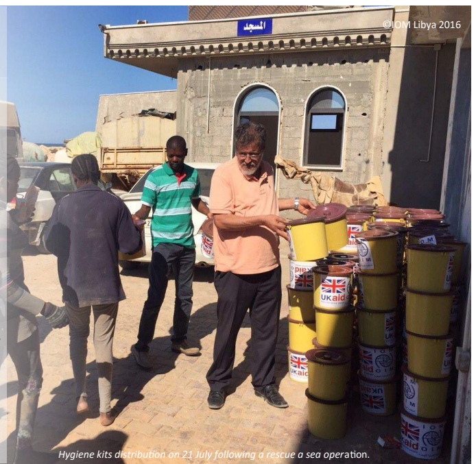
Hygiene kits distribution on 21 July following a rescue at sea operation.

Among the rescued migrants there was one pregnant woman with two children. The woman expressed deep gratitude to the Libyan Coast Guard for saving her one-year-old baby who fell off the boat. The boy was close to drowning when the men on board dived into the sea and saved the boy's life. One of the other rescued migrants had suffered from a gunshot wound for four days and received medical treatment upon arrival to the shore.