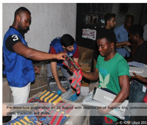
Pre-departure preparation on 22 August with distribution of hygiene kits, underwear, shirts, tracksuits and shoes.

The funding for this charter was provided by the Swiss State Secretariat of Migration , under the project "Provision of Humanitarian Repatriation and Reintegration for Stranded Migrants in Libya," the UN - Central Emergency Fund (CERF) under the project "Protection and Direct Assistance to Stranded Migrants in Libya" and the Kingdom of the Netherlands under the project "Enhancing saving lives at sea by the Libyan Coast Guard and support humanitarian repatriation of vulnerable migrants out of Libya." Press release currently in process.