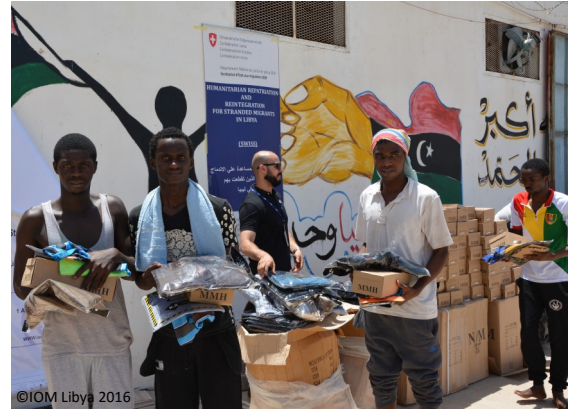
The funding for this charter was provided by the Swiss Secretariat of Migration, under the project "Provision of Humanitarian Repatriation and Reintegration for Stranded Migrants in Libya" and the European Union under the project "Repatriation Assistance for Vulnerable Migrants Stranded inside Libya & Promoting Stability in Libya's Southern Regions."

A number of those who had been detained explained to IOM that their main objective was to return home after enduring several months in harsh conditions.