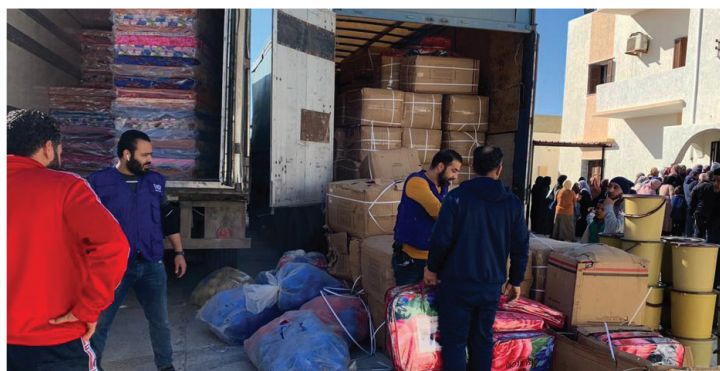
Distribution of non-food items for IDPs in Tripoli.