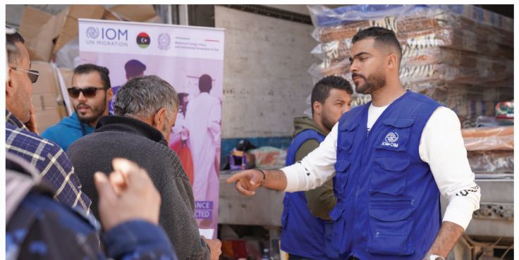
Distribution of non-food items for IDPs in Suq Al Jomaa.