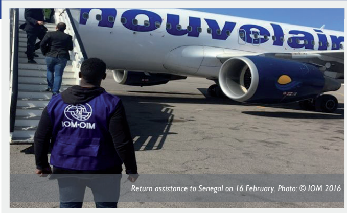
Return assistance to Senegal on 16 February.