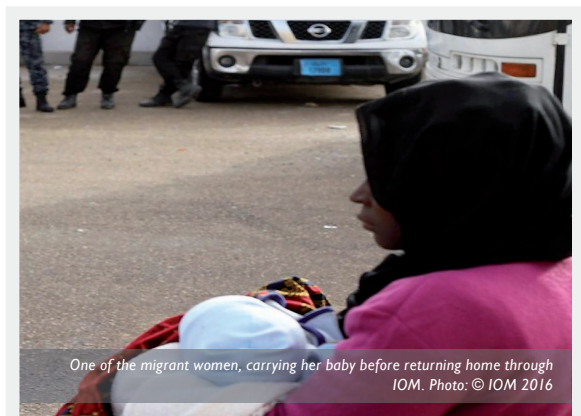
One of the migrant women, carrying her baby before returning home through IOM.

Furthermore, two vulnerable migrants, one suffering from mental illness and another who is a survivor of severe torture, were assisted with medical and shelter assistance. Both will be returning to their countries of origin within short. A third migrant suffering from mental illness was also provided with medical assistance and assistance with family tracing.