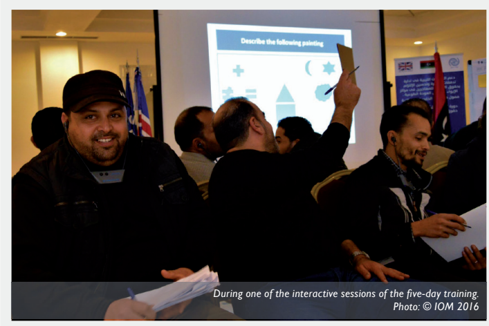
During one of the interactive sessions of the five-day training.