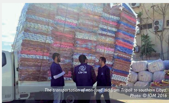
The transportation of non-food aid from Tripoli to southern Libya.

4,700 winter blankets were also delivered to Tripoli and will be distributed to migrants and IDPs in need.