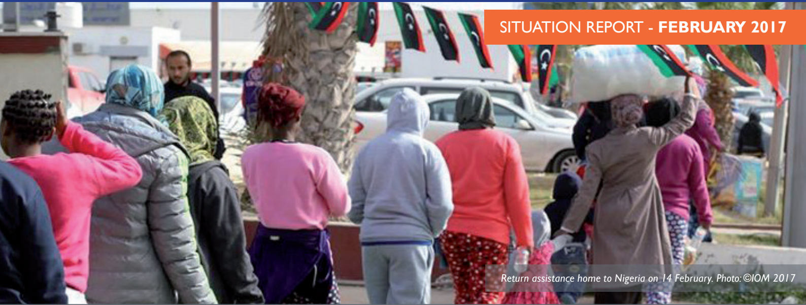
Return assistance home to Nigeria on 14 February.

On 6-7 February, IOM convened Community Management Committees from Al Qatrun to discuss the programme's achievements and challenges in 2016, and to plan for 2017.