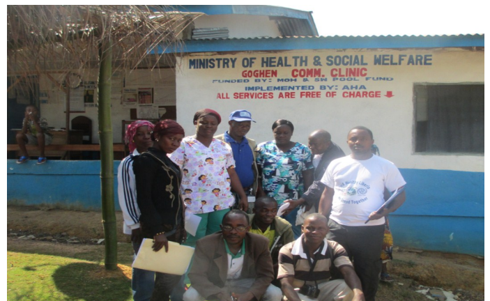
Tubmanburg ETU staff conducted a rapid health assessment of all MoHSW health facilities in Bomi County between December 28 and January 8.

Funding for IOM Liberia Ebola Response provided by