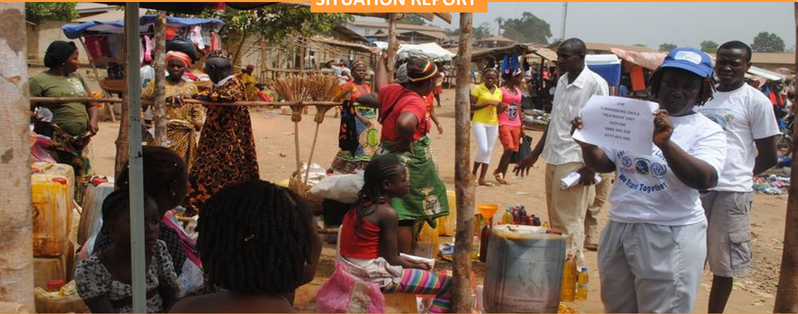
ETU staff raising awareness of infection prevention control at weekday market in Bomi County