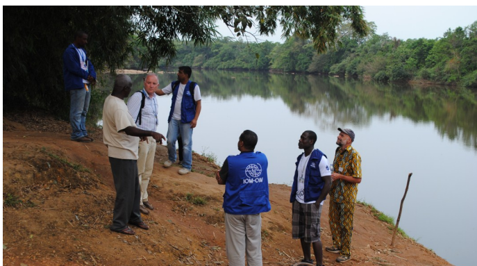
IOM Border assessment team and border officials inspecting a crossing point along the Mano River, the border between Liberia and Sierra Leone.

“We work with the leaders in the community to observe any existing gaps so we can help in preventing infection. We found that they do not have points to wash hands so we came with big buckets and chlorine” Read more about what IOM is doing to contain the spread of Ebola in the Counties, here .