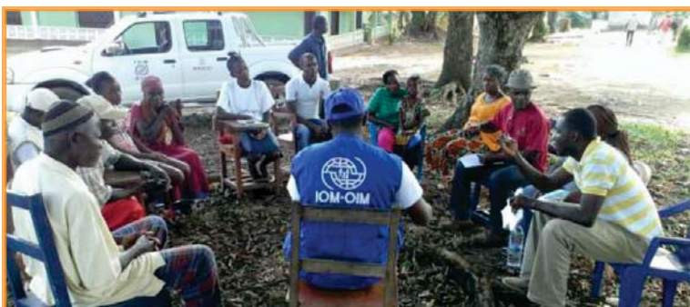
IOM ETU staff participate in community focus group discussions as part of Health Recovery Assessment, Sass Town rural community, Bomi County