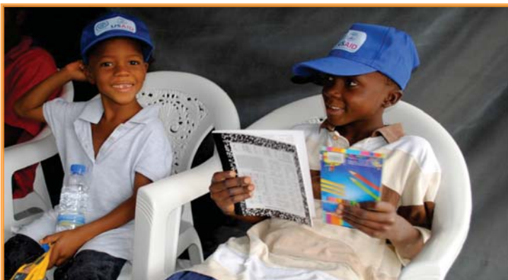
The Psychosocial Team at the Tubmanburg ETU worked with the Bomi County Health Team to ensure the successful return and reintegration of the child survivors.