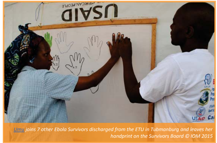
Umu joins 7 other Ebola Survivors discharged from the ETU in Tubmanburg and leaves her handprint on the Survivors Board