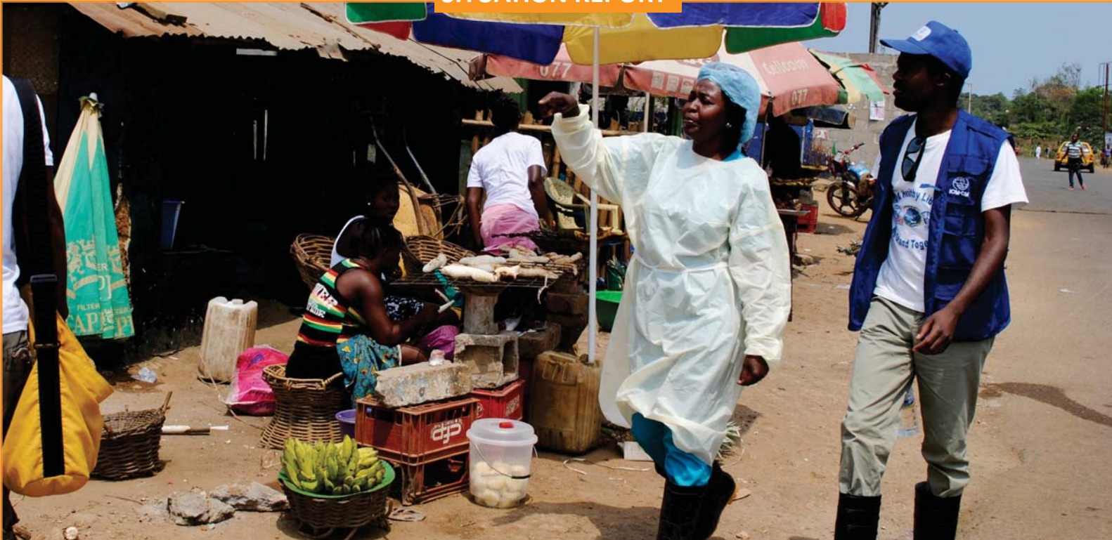
IOM Tubmanburg Outreach Team & Bomi CHT encourage travellers to use official crossing points for hand washing & health screening.