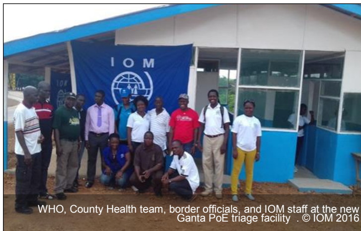
WHO, County Health team, border officials, and IOM staff at the new Ganta PoE triage facility.

From 17-19 May 2016, the Ministry of Health conducted a training of trainers for rapid response teams (RRT). The training will be rolled out to all counties. IOM case management coordinators attended and will implement the RRT training in Bomi, Gbarpolu, Maryland, Grand Gedeh, and River Gee.