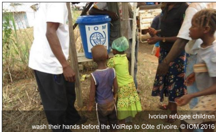
Ivorian refugee children wash their hands before the VolRep to Côte d’Ivoire.

In May, IOM supported the UNHCR-led voluntary repatriation of 1,757 refugees to Côte d’Ivoire . In Maryland and Grand Gedeh counties, IOM screened refugees’ temperatures and ensured hand washing at the border before they returned to Ivory Coast.