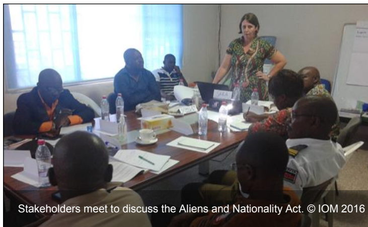
Stakeholders meet to discuss the Aliens and Nationality Act.

On 3 June 2016, stakeholders convened at IOM to discuss issues on nationality including the prevention of statelessness, naturalization by marriage, provision for children found on Liberian soil whose parents cannot be located, and grounds for revoking nationality. On 9 June 2016, the stakeholders met again to discuss employment issues related to the Act.