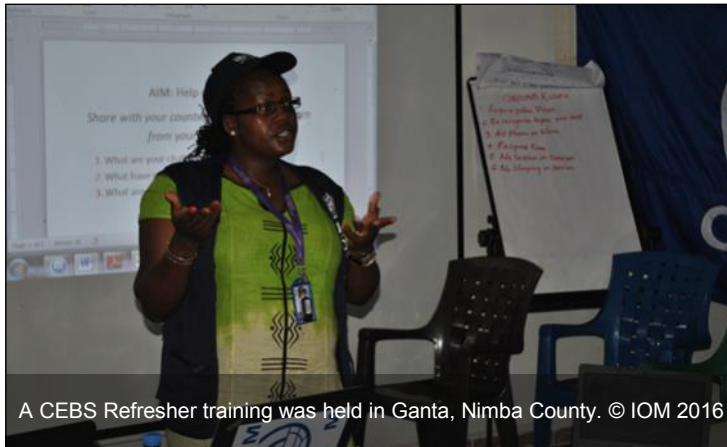
A CEBS Refresher training was held in Ganta, Nimba County.

On 2-3 June 2016, a refresher training of trainers was conducted in Nimba as part of the ongoing CEBS activity. The training brought together 78 participants from eight border counties representing implementing partners, WHO and MoH . The training served to reinforce the importance of CEBS, share improved methodology, increase case finding ability, and strengthen links between the County Health Teams, IPs and IOM. The rollout training will be provided to 2,986 gCHVs by those who attended the ToT throughout the course of June.