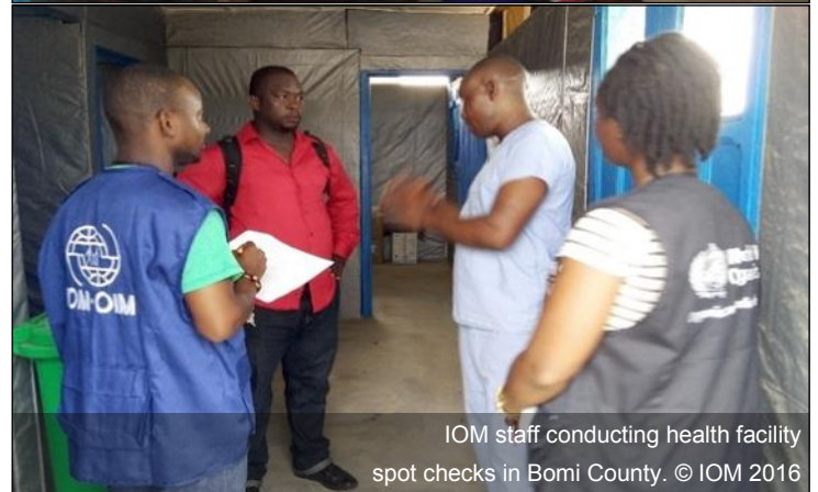
IOM staff conducting health facility spot checks in Bomi County.