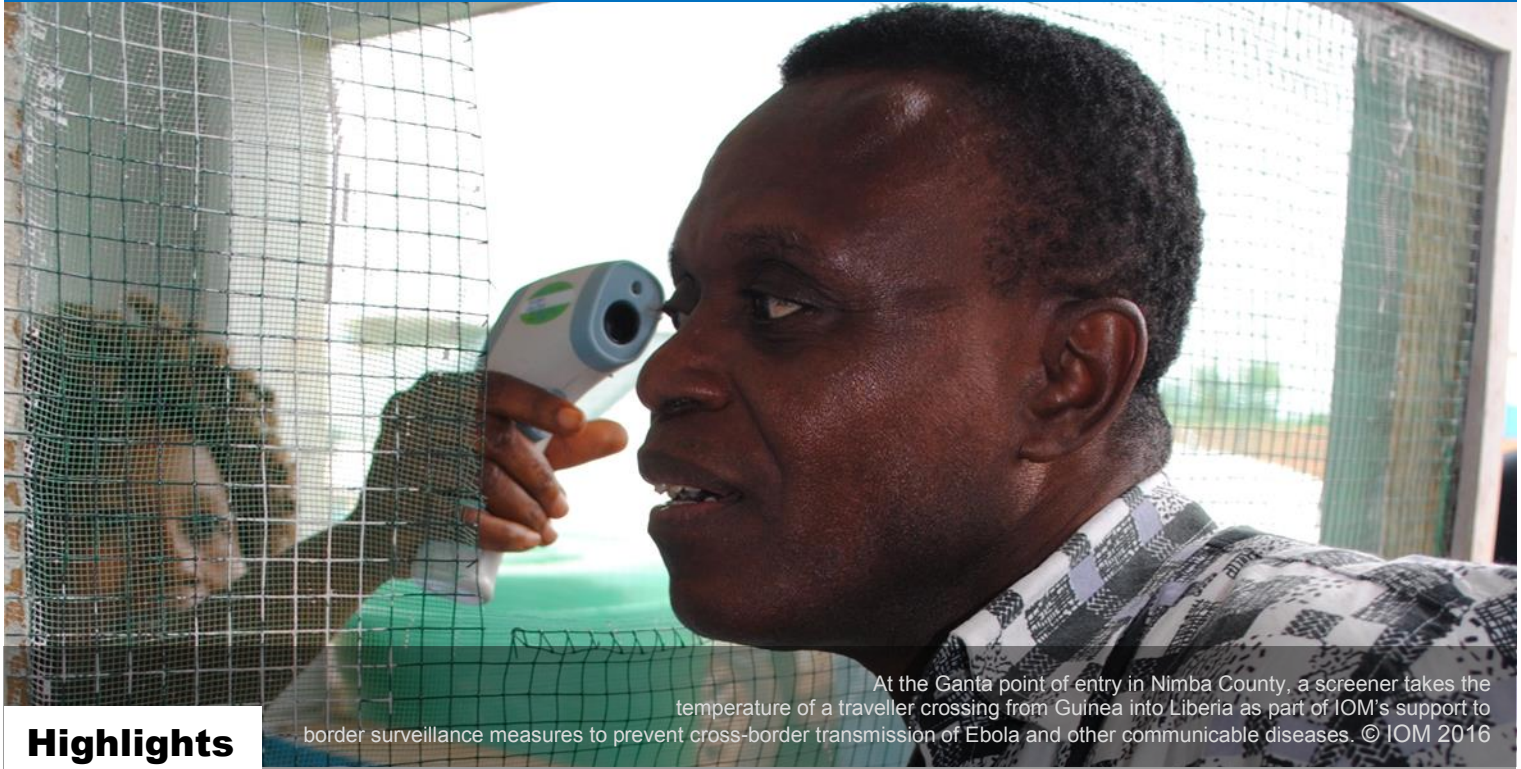
At the Ganta point of entry in Nimba County, a screener takes the temperature of a traveller crossing from Guinea into Liberia as part of IOM's support to border surveillance measures to prevent cross-border transmission of Ebola and other communicable diseases.