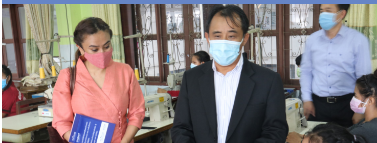
IOM and SDED visiting Skills Development Centre, Vientiane Capital.