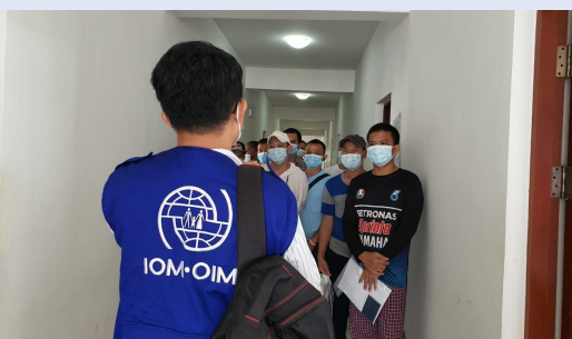
IOM staff introducing safe migration to AVRR beneficiaries, Vientiane Capital.

"I was working as a Barista at a coffee shop in Bangkok for almost two years. During the pandemic, the coffee shop was open for only three days a week, which lowered my salary by 60 to 70 percent. Since my job was affected, I decided to return to Lao PDR where it is safer and there are fewer cases compared to Thailand. Read more here.