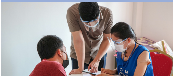
IOM staffs interviewing returned migrant at 27KM QC, Vientiane Capital.

Continued to collect data for the Socio-economic Impacts of COVID-19 on Migrant Workers Survey in Vientiane Capital, Savannakhet and Champasak Province: