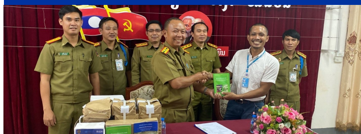
IOM staff handing over SOP and IEC materials to DOI, Wattay International Airport.