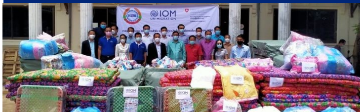
IOM with SDED handing over NFI to QC management, Champasak Province.