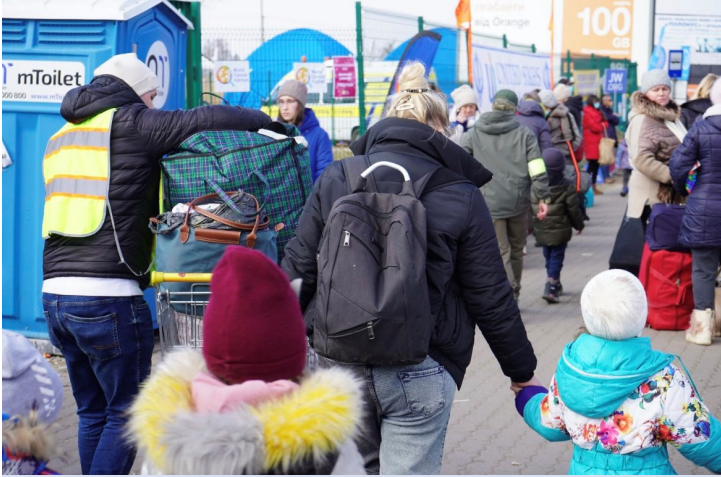
Over 6,000 displaced persons fleeing Ukraine and requiring assistance arrived at Medyka BCP on 19 March.

The mission continues to provide consultations to conflict-affected people through IOM Poland's Infoline. From 24 February to 20 March, IOM provided 671 consultations for 429 women and 242 men, of which 419 persons were Ukrainian nationals. Consultations were provided in Ukrainian (250), Polish (251), Russian (172) and English (60) and the majority of inquiries were related to legal stay, visa extensions, legal employment, PESEL numbers, establishing a temporary legal guardian for a minor, and legal travel within the Schengen Zone.