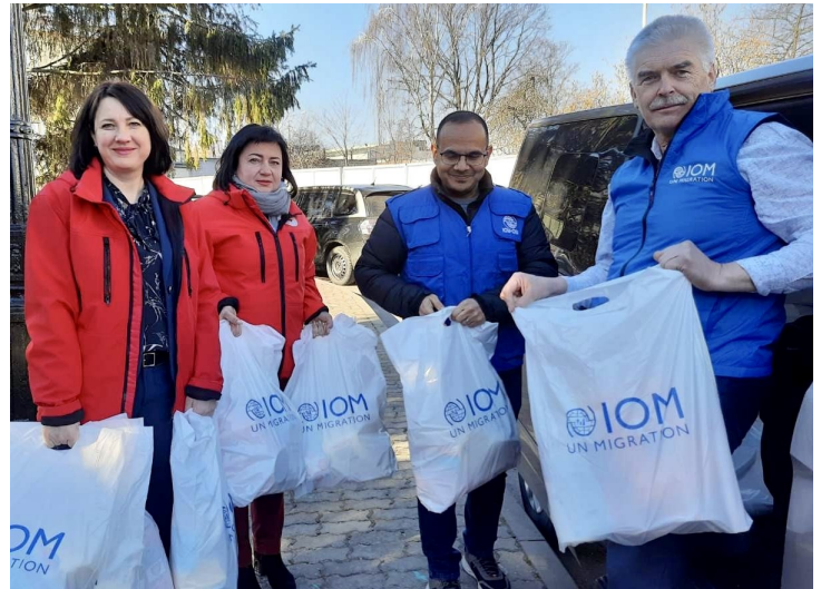
IOM Belarus donates 150 bags of food and hygiene items for distribution at the border by the Belarusian Red Cross.