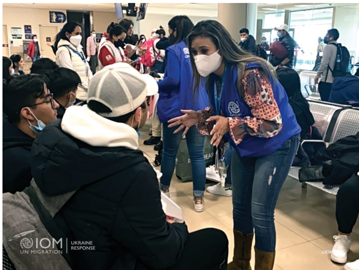
IOM Ukraine is present at temporary reception centres across the country to provide support to IDPs and third country nationals.

Staff Capacity: 289 (Kyiv-based staff have been relocated to