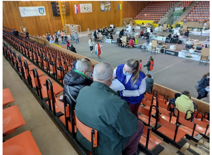
IOM Slovakia assesses the needs of persons at the Michelovce Transit centre.