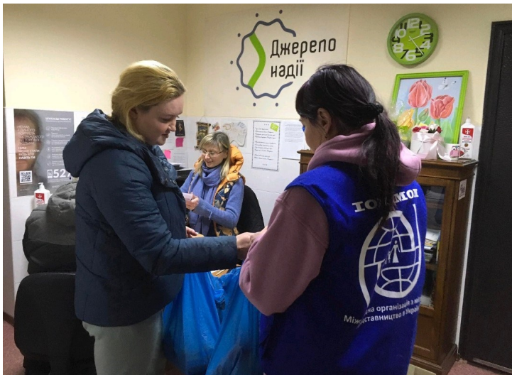
IOM Ukraine and NGO "Spring of Hope" distribute food and hygiene kits to families in Vinnytsia.

Alongside its ongoing assessments, IOM continues to distribute non-food items (NFI) within the country to displaced persons. To date, the mission has distributed more than 12,000 thermal blankets to newly displaced persons in collective centres in Lviv, Ivano-Frankivsk, Dnipro, Mykolaiv and Zakarpattia Regions. In coordination with the State Migration Service of Ukraine, IOM has distributed much needed food items and kitchenware at two IDP shelters in Zakarpattia region and also provided hygiene kits to four social institutions in Luhansk non-government-controlled area. The mission recently received a USAID-BHA shipment in Uzhhorod with 28 tonnes of critical assistance and intends to distribute 7,900 hygiene kits to the most vulnerable IDPs over the next several days. Since the