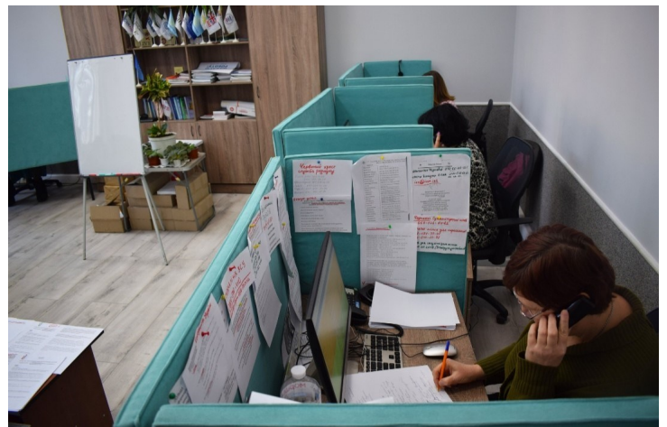
IOM Ukraine and partner "Revival of the Nation" NGO continue to run a national hotline for migrants and internally displaced persons.

As the situation in the country steadily deteriorates, IOM Ukraine has sought to expand a number of protection services. From 24 February to 16 March, the mission provided 12,083 consultations through the national toll-free migrant advice and counter-trafficking hotline ("527"). The largest number of calls (59 per cent) came from internally displaced persons, while female callers were the most prevalent group to use the hotline (61 per cent). The top three most common subjects of the calls included: general information about human trafficking and safe travel; procedures for seeking asylum and obtaining refugee status; and possible support from diplomatic institutions and relevant organizations.