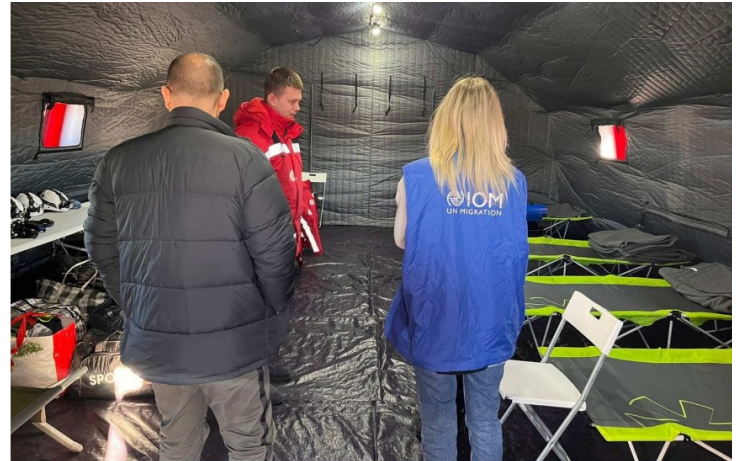
IOM representatives visiting the tents installed by the BRC to provide assistance to refugees and migrants from Ukraine

On 16 March, IOM visited Gomel and Gden village, Bragin district, near the Belarus-Ukraine border, to conduct a needs assessment to inform potential response activities. The mission also visited the Belarusian Red Cross (BRC), who currently work at the border and operate two tents to provide first aid to displaced persons.