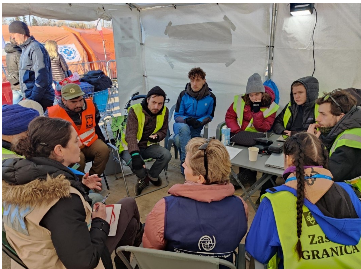
IOM Poland and UNHCR hold a joint training for volunteers on counter trafficking and PSEA at Medyka BCP.

IOM Poland is particularly concerned about the risk of human trafficking and sexual exploitation and abuse (PSEA) among incoming Ukrainian refugees and third country nationals. IOM and UNHCR recently facilitated a training on counter trafficking and PSEA for volunteers at the Medyka border control point, one of the primary BCPs receiving persons fleeing Ukraine. The mission continues to collaborate with all implementing partners, donors, and the Polish authorities on the provision of life-saving assistance, including counter-trafficking and PSEA support, to all displaced persons, regardless of nationality.