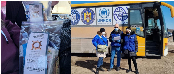
IOM Moldova provides food packages to Ukrainian refugees prior to transit to Romania