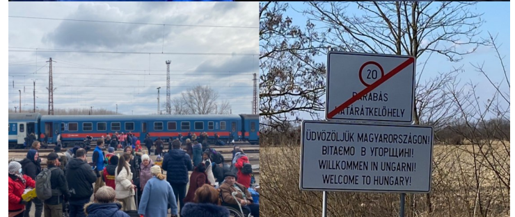
IOM Hungary provides information and support to third country nationals and Ukrainian refugees at the border.