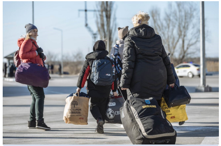
Refugees arriving to Planaca BCP in Moldova.

IOM Moldova's Migration Health Division together with IOM Ukraine facilitated the safe movement of Ukrainian refugees to Romania and performed pre-departure health check-ups. The missions identified health needs and provided refugees with medications and food packages.