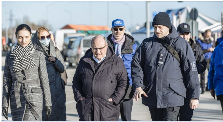
IOM's Director General meets with partners at Palanca BCP in Moldova.

From 24 February to 14 March, approximately 330,270 persons have entered Moldova from Ukraine (297,728 Ukrainians and 32,542 TCNs) according to the Ministry of Interior and the Moldovan Border Guard in coordination with IOM Moldova. It was reported that 221,705 persons (190,734 Ukrainian refugees and 30,971 third country nationals) have already left Moldova to Romania.