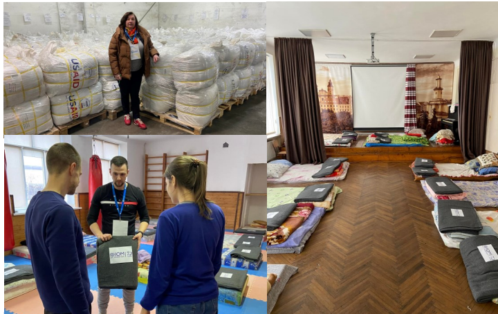
IOM's distribution of USAID-BHA blankets continued, in coordination with partner Caritas.

Despite relocation of staff across the country, IOM is committed to remaining in Ukraine and supporting the humanitarian response. To date, IOM continues to operate from Lviv, Ivano-Frankivsk, and Uzhorod. Warehouses are already set up in Uzhhorod and Lviv, as well as in Kosice, Slovakia and approximately 2,000 cubic meters of in-kind support will reach Poland in the coming days while over 260,000 shelter and non-food item (NFI) kits are in the pipeline. Meanwhile, the mission has continued its distribution of 18,000 blankets, donated by USAID's Bureau of Humanitarian Assistance, with implementing partner Caritas. The organizations delivered 2,085 blankets to 10 schools in the Ivano-Frankivsk region that are currently serving as shelters for internally displaced persons and plans to continue to distribute to collective centres in Uzhhorod, Lviv, Dnipro and Mykolaiv.