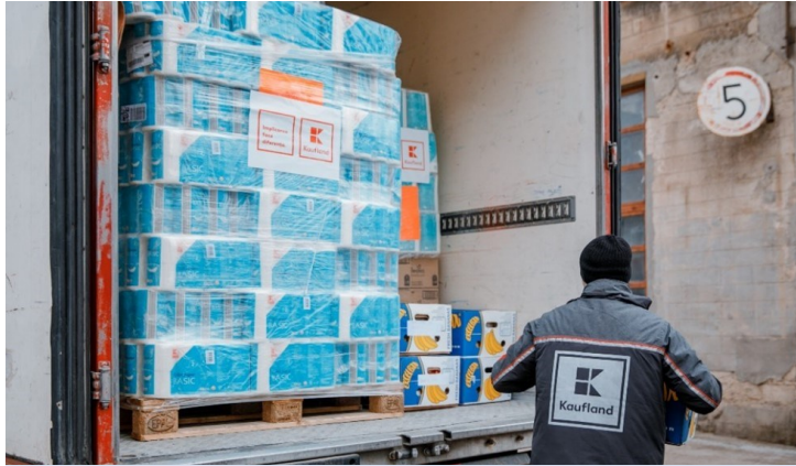
Donations arriving at the Single Crisis Management Centre's warehouse.

IOM has donated 12 mobile phones to the General Border Police Inspectorate, along with medical supplies and food items. Two trucks have arrived with NFIs and WASH items from in-kind donations from NGO SOS Attitude and two additional trucks are scheduled to arrive on 10 March.