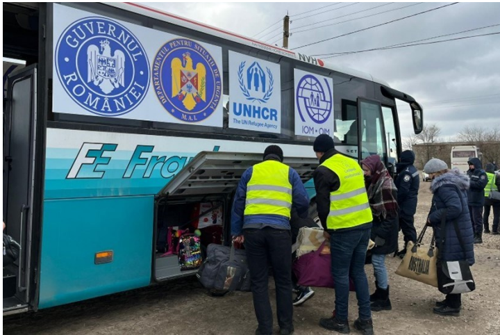
UNHCR and IOM Romania facilitated a humanitarian “Green Corridor.”

Staff Capacity: 28 (with an additional 25 consultants)