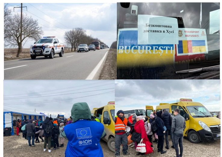
IOM Moldova and UNHCR facilitate a humanitarian “Green Corridor” to transport Ukrainian refugees.

IOM Moldova’s Migration Health Department team, together