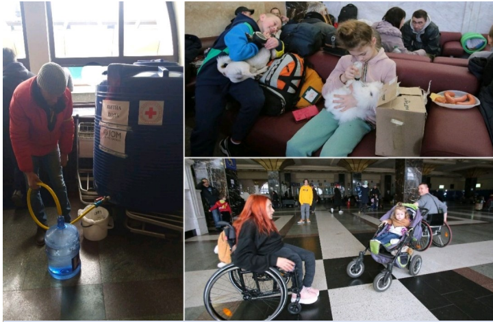
IOM and Red Cross Ukraine provide drinking water in Kyiv.

Despite relocation of staff across the country, IOM is committed to remaining in Ukraine and supporting the humanitarian response. To date, IOM has established a presence in Lviv, Ivano-Frankivsk, and Uzhorod. As of 11 March, IOM is also in the process of establishing four warehouses in Ukraine in Lviv, Uzhorod, Berehove, and Chernivtski.