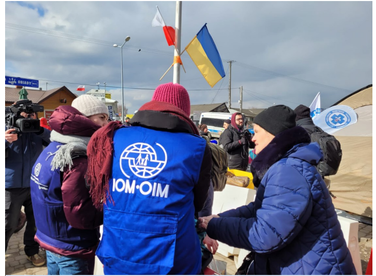
The IOM Director General visits the Poland-Ukraine border.

Centre for International Aid (PCPM), and International Medical Corps (IMC). Participants discussed such topics as joint service mapping, needs assessments, and capacity building, particularly at the border.