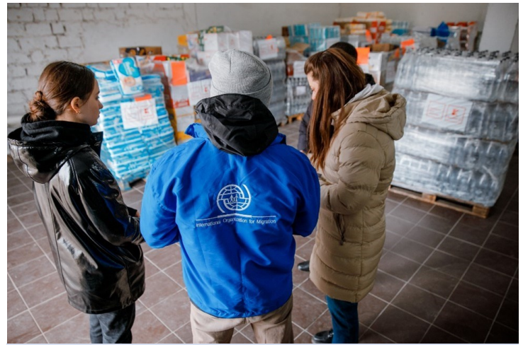
IOM Moldova and Kaufland Moldova at the Single Crisis Management Centre’s warehouse.

To provide a better understanding of the movements and evolving needs of displaced populations, IOM Moldova is conducting Displacement Tracking Matrix (DTM) analysis to track migration flows to and out of Moldova. The first phase of DTM is being carried out between 9 March and 8 April, with CBS-Research collecting data through face-to-face interviews at the five primary border crossing points (three Ukraine-Moldova BCPs and two Moldova-Romanian BCPs) and within four major temporary placement centres (Palanca, MoldExpo, Manej Sport Arena, and Sports Lyceum). The