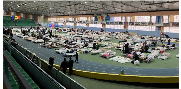
IOM conducted an assessment of Manej Sport Arena.

The Logistics Cluster has set up a warehouse in Chisinau, to be used by all Cluster partners. The mission procured 70,000 leaflets in Ukrainian (50,000), Russian (10,000), and English (10,000) for Ukrainian nationals (MDL 57,400) and delivered the leaflets to the Bureau for Migration and Asylum. Finally, IOM provided its third batch of hygiene supplies and food products to the Palanca BCP and will continue to deliver donations.