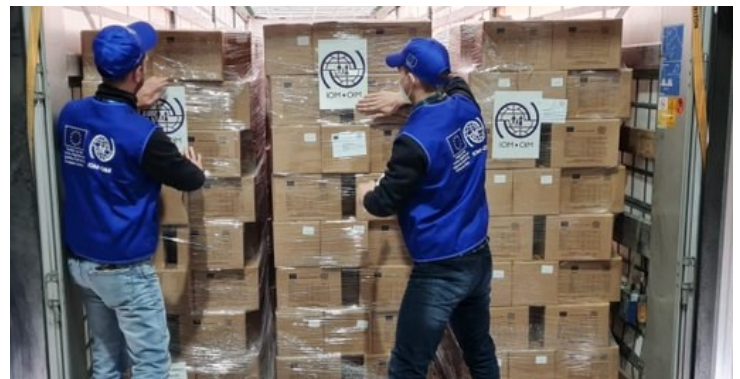
IOM shipment from Greece to Poland.

IOM has been closely coordinating with the Logistics Cluster in Rzeszow, where the Cluster warehouse is set up. The Cluster has established warehouses in Warsaw and Rzeszow, and non-food item (NFI) kits and hygiene have been procured and will arrive in the country on 8 and 9 March. On 5 March, IOM sent a shipment from Greece to Poland containing humanitarian relief items to support 3,200 people who had fled from Ukraine.