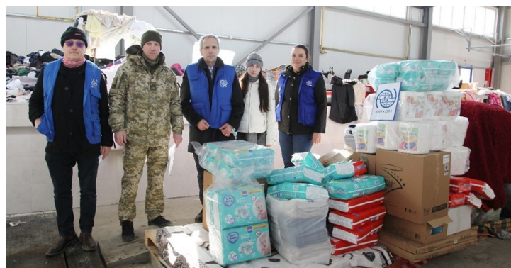
IOM donated a third batch of hygiene supplies to Palanca BCP.

A Tunisian family was referred to IOM Moldova by the Tunisian Embassy in Romania for assistance with ground transportation to Bucharest, from where repatriation flights to Carthage are being organized by the Tunisian Government. The mission provided humanitarian communication (embassy, border police), pre-departure checks, snack packs, personal protective equipment, medicine, and ground transportation.