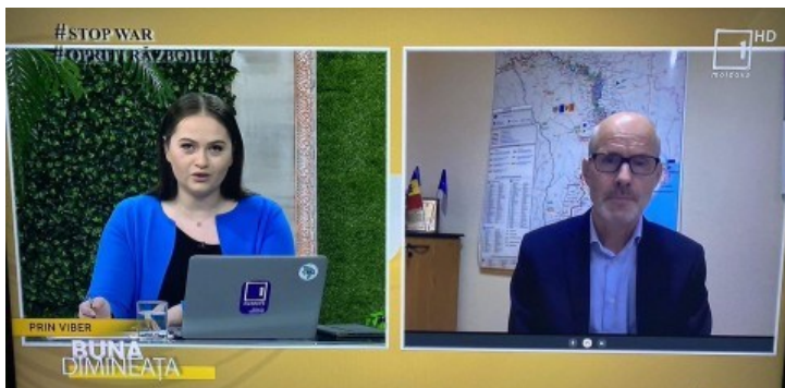
IOM Moldova's Chief of Mission gave an interview with Moldova 1.

From 24 February to 7 March, approximately 267,084 persons have entered Moldova from Ukraine (226,009 Ukrainians, 12,399 nationals, and 28,676 TCNs) according to the Ministry of Interior and the Moldovan Border Guard in coordination with IOM Moldova. It was also reported that approximately 150,514 persons (126,293 Ukrainians and 24,221 TCNs) who had entered Moldova from Ukraine have departed the country to Romania. Finally, approximately 7,679 persons (7,052 Ukrainians, 157 nationals, and 470 Third Country Nationals) have entered Ukraine from Moldova.