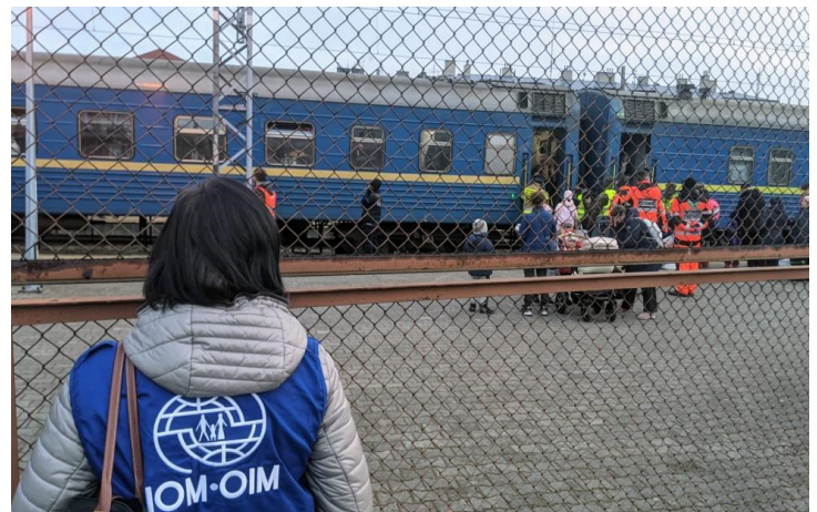
IOM Poland Chief of Mission visits key border crossing points along the border of Poland and Ukraine.

On 2 March, an IOM rapid assessment team visited Mlyny Reception Centre, located approximately 6km from the Polish-Ukraine border crossing of Korczowa, and conducted 14 informant interviews with persons at the reception centre. Over 800 Uzbek nationals were present in the centre on 2 March 2022, the largest nationality represented, followed by nationals of Vietnam, Ukraine, and Tajikistan. While local government, UN agencies, NGOs, and volunteers continue to support the response at the border through the provision of hot meals, temporary accommodation, transportation, information services, and other assistance, reception facilities require additional WASH facilities and bathrooms.