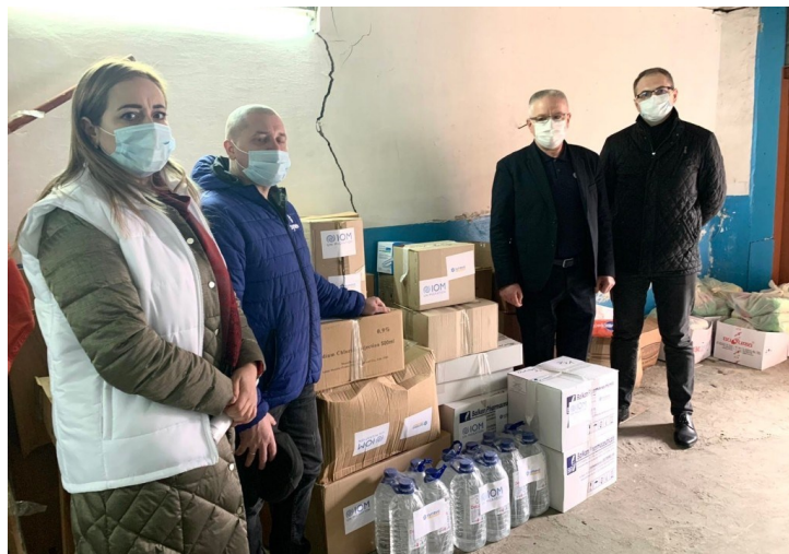
IOM, in collaboration with Synevo Medical Laboratory, donated a batch of medical supplies

A CCCM expert and a CBI expert were deployed to Moldova to support the response at the border, with another expert in CCCM/Protection to follow.