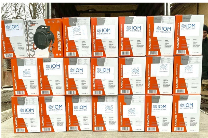
Supplied donated by IOM Moldova to the Border Police

Ukraine has closed the entry into Moldova through the Transnistrian section of the Moldova-Ukraine border. IOM Moldova has reached an agreement with the Moldovan Customs Service to support humanitarian access at the border. On 2 March, the General Inspectorate of the Border Police received the second batch of equipment needed at the border crossing points with Ukraine. IOM donated 300