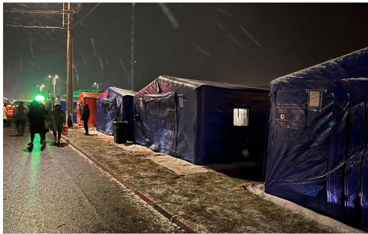
Temporary shelters along the Romanian-Ukrainian border.

IOM Romania, in partnership with IOM Ukraine and IOM Moldova, developed an information sheet containing general information regarding the risks for refugees and important contact details in the event of potential exploitation and human trafficking. The mission has also published an orientation and conversation guide for Ukrainian citizens that provides translations and audio recordings of useful phrases, accessible here .