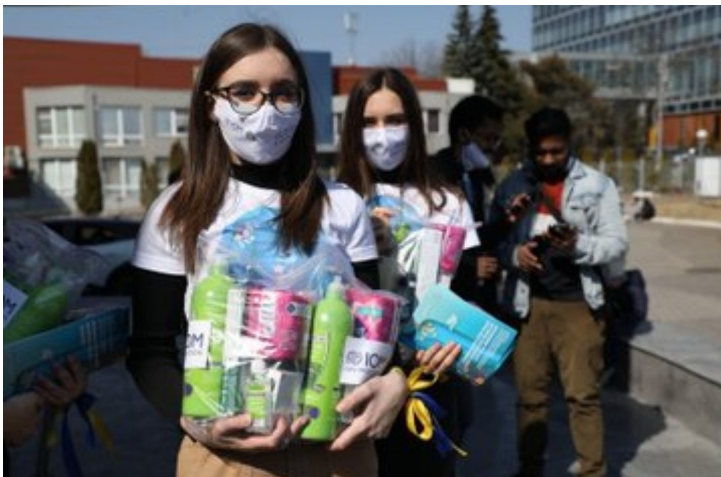
Medical students help distribute IOM hygiene kits at accommodation centres in Chisinau.

In Moldova , IOM is coordinating closely with a variety of stakeholders to facilitate the procurement and distribution of necessary non-food items (NFIs) to refugees and third country nationals. On 24 March, the mission distributed 500 hygiene kits to beneficiaries in five refugee accommodation centres (RAC) in Chisinau during awareness raising activities conducted to honour World Tuberculosis Day, in collaboration with the Medical University in Chisinau.