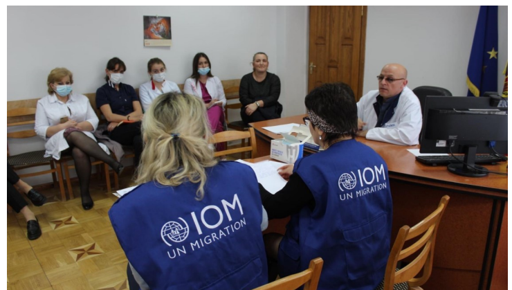
IOM staff provided a training for doctors who assisted with the transfer of Ukrainian refugees from Moldova to Germany.

In Moldova , on 25 March, IOM supported the transfer of 133 of the most vulnerable Ukrainian refugees on a chartered flight to Germany, in coordination with the German Federal Foreign Office (GFFO). IOM's activities included pre-embarkation health checks, assignment of a medical escort, pre-embarkation briefings, distribution of personal protective equipment (PPE), baggage handling, ground transportation, distribution of snack packs, and airport assistance. Prior to the trip, the mission also provided participating doctors with specialized training on the care needs of refugees.