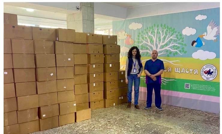
Hospital staff in Mukachevo receive 150 baby hygiene kits.

In response to the lack of access to healthcare during displacement and the ongoing COVID-19 pandemic, IOM is providing a range of health services, including mental health and psychosocial support (MHPSS).