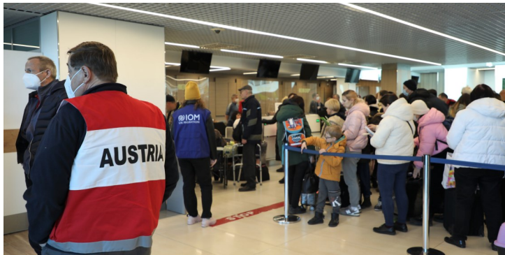
The first flight of Ukrainian refugees from Moldova departs to Austria.

Also in Moldova , on 21 March, IOM facilitated the movement of 142 Ukrainian refugees departing from Moldova to Austria