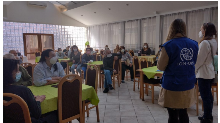
IOM staff provide information on the temporary protection directive to Ukrainian refugees at Kosice Hotspot, Slovakia.

In Poland , IOM actively coordinates with local authorities as well as NGOs to provide site management support and other services. IOM recently met with the Mayor of Medyka, who