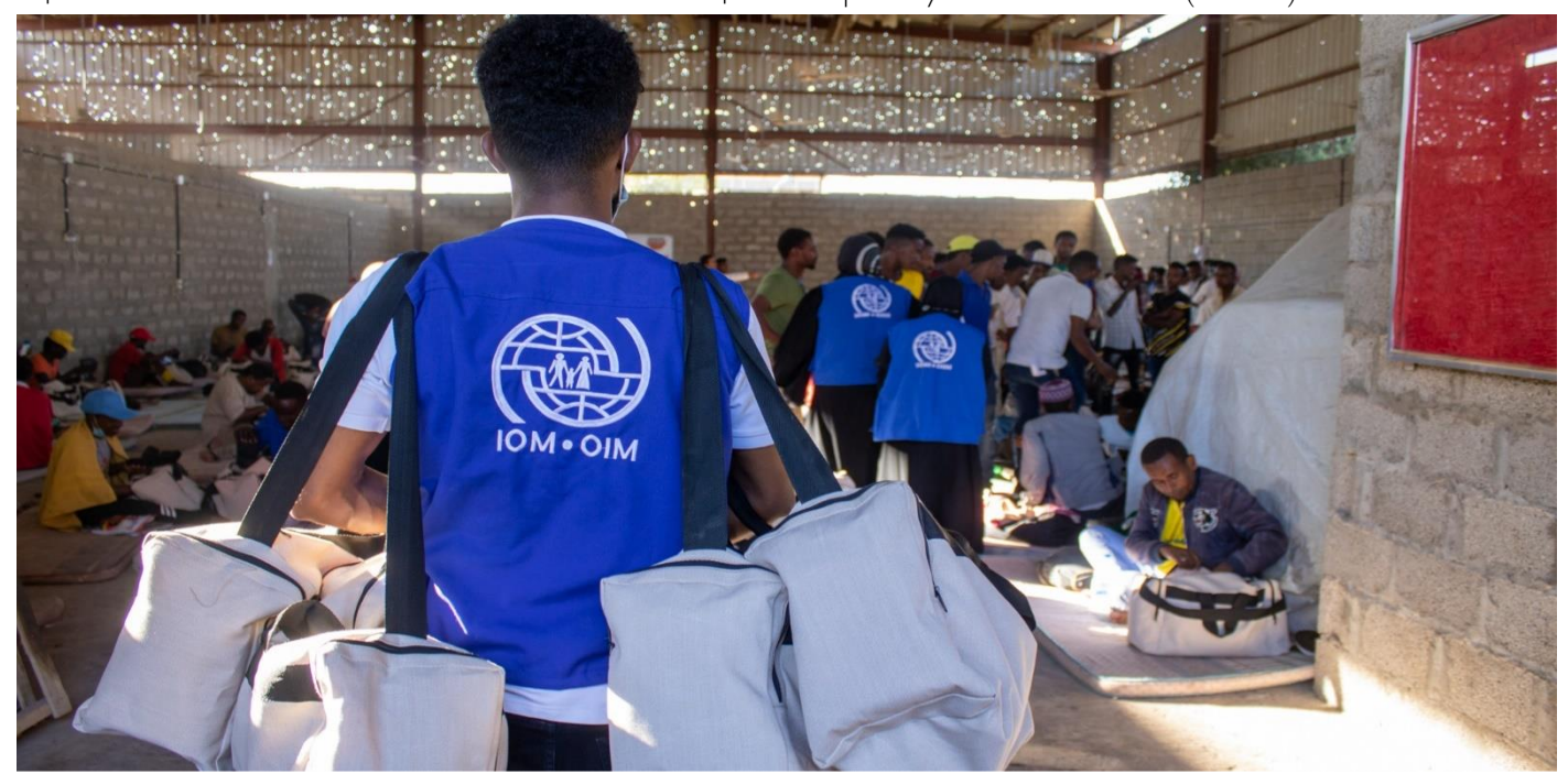
IOM staff distributing dignity kits to migrants at migrant assembly points