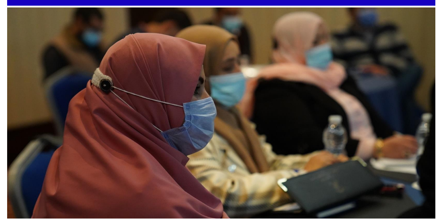
A community member participates in IOM's mental health and psycho-social support (MHPSS) training in response to COVID-19

IOM Regional Office for Middle East and North Africa Situation Report 22 (26 March — 29 April 2021)