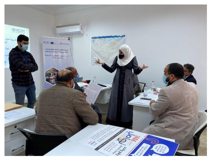
IOM in Libya conducted a humanitarian coordination and protection training with UN OCHA

Information, education and communication (IEC) materials were also distributed across all six (6) governorates to adults and children in internally displaced persons (IDP) camps, schools, healthcare centers, and through door-to-door visits. These materials were produced to increase community awareness about COVID-19 protective measures, signs and symptoms, and health services provided at primary healthcare centers, camp clinics, and hospitals. A total of 14 community mobilizers were trained during the reporting period on RCCE. IOM conducted 12 communication with communities (CwC) and accountability to affected populations (AAP) trainings for camp management staff in Jeddah five (5) Camp, attended by 56 participants and eight (8) CwC/AAP trainings for RCCE mobilizer in Kirkuk, Baghdad, and Mosul governorates, attended by 36 participants. IOM designed COVID-19 rollups for testing at Erbil International Airport. IOM also held 342 sensitization and awareness raising sessions on COVID-19 general precaution measures and hygiene in Anbar, Baghdad, Basra, Dohuk, Erbil, Ninewa, and Salah Al-Din governorates, reaching 2,337 people. More specifically, IOM's community stabilization unit, and its CSO partner Dak, reached 142 people through 14 awareness sessions focused on COVID-19 prevention education in Shariya Camp in Dohuk Governorate, and Hamdaniyah and Tel Afar districts in Ninewa Governorate.