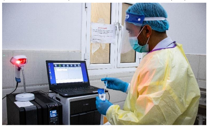
Health worker testing samples on Genexpert device provided by IOM in an isolation centre in Al Makha

In Iraq, IOM conducted 714 COVID-19 sensitization and awareness raising sessions, reaching 5,178 people in Erbil, Dohuk, Ninewa, Kirkuk, Anbar, and Baghdad governorates. These activities were organized jointly in collaboration with local non-governmental organizations (NGOs) and civil society organizations (CSOs), the Department of Education (DoE), community leaders and community police.