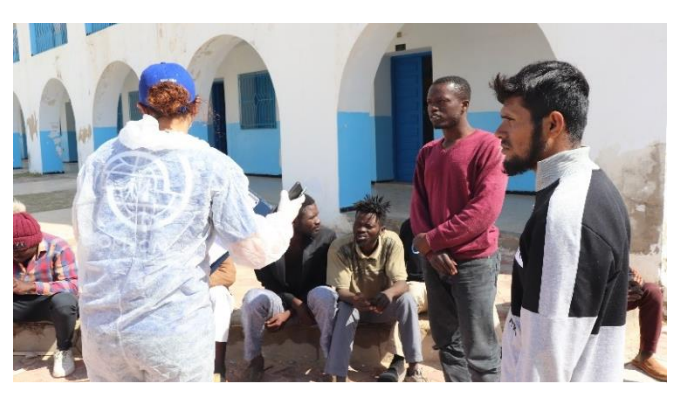
IOM in Sfax, Tunisia providing urgent humanitarian assistance to rescued at sea migrants.

In Libya , IOM conducted fumigation, disinfection, and cleaning interventions in 12 detention centres (DC), one (1) isolation centre as well as in ten (10) disembarkation points (DP) as part of the campaign to combat the