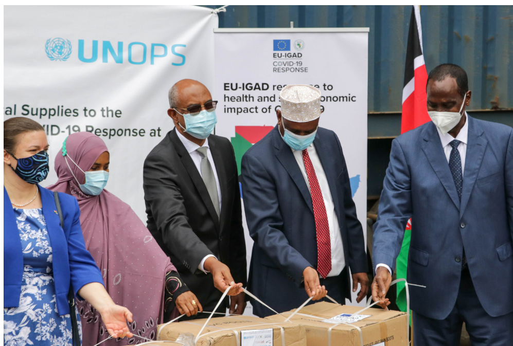
EU-IGAD COVID-19 RESPONSE provided test kits, PPEs, ambulances & mobile lab for #COVID-19 response in Turkana, Marsabit, Garissa, Mandera & Wajir counties. IOM Kenya, UNOPS, UNICEF & TradeMark East Africa are implementing partners.

IOM Djibouti provided life-saving assistance (including water, food and medical first aid) to 511 returning migrants from Yemen.