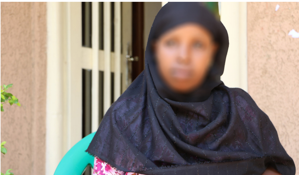
"Since I returned home I have been feeling unwell and mentally unstable," narrates an Ethiopian returnee assisted by the EU-IOM Joint Initiative and Save the Children to deal with the trauma of her migration journey.

IOM Somalia shared COVID-19 information with over 4,200 people entering and exiting Somalia. IOM also shared COVID-19 information with 2,000 individuals who reported to be unaware of the pandemic. IOM South Sudan is conducting regular weekly assessments of COVID-19 preparedness and response measures across 90 locations, combining border points, airports and internal transit points. Some 59 locations submitted their updates during the week. DTM enumerators carried out 3,305 interviews representing 7,493 individual movements across 24 Flow Monitoring Points (FMP). DTM is operating four displacement site FMPs at the gates of the Protection of Civilian (PoC) sites in Wau, Bentiu and Malakal as well as Masna Collective Centre. Enumerators conducted 596 interviews representing 1,614 individual movements.