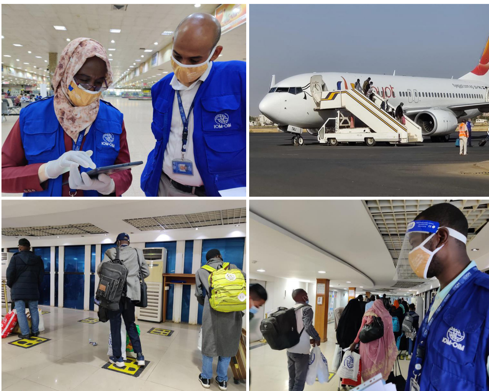
The EU-IOM Joint Initiative has assisted 150 vulnerable Sudanese migrants to voluntarily return home on a charter flight from Egypt.

The report says the number of people acutely food insecure could rise to 41.6 million before the end of 2020 due to COVID-19.