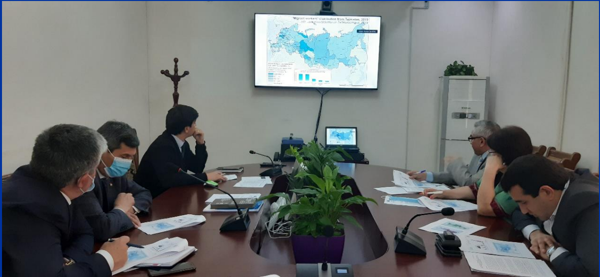
The second meeting of the Technical Working Group on Migration and Disability at the Ministry of Health and Social Protection of the Republic of Tajikistan, 20th April

On 20 April, IOM Tajikistan joined the second meeting of the Technical Working Group on Migration and Disability, which was hosted by the Ministry of Health and Social Protection of the Republic of Tajikistan. The event was in the framework of the IOM project titled 'Returned Tajik Migrants: Promoting a Multi-stakeholder Response to Mental Health and Disability Issues'. Participants discussed the methodology of research that is aimed at improvement and better understandings of occupational injuries, morbidity and disability among migrant workers.