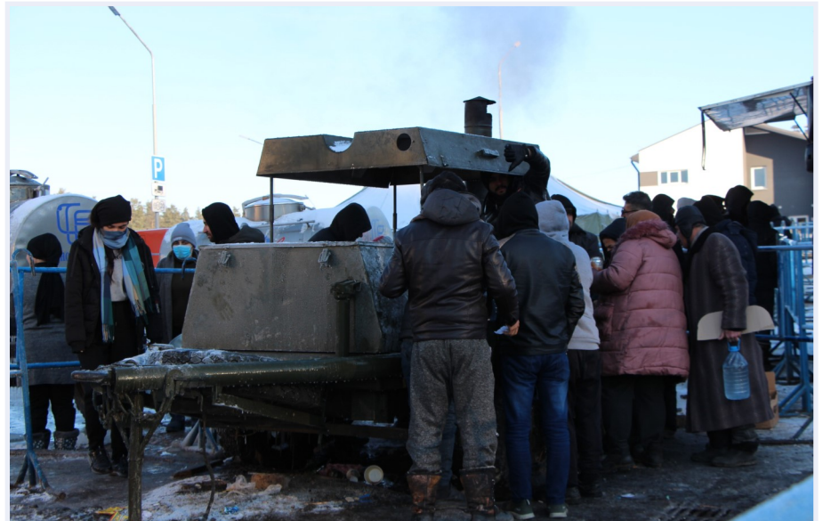
Migrants outside the logistics facility near the Belarus-Poland border

333 kg of food items and 98L of milk delivered by IOM during the reporting period.