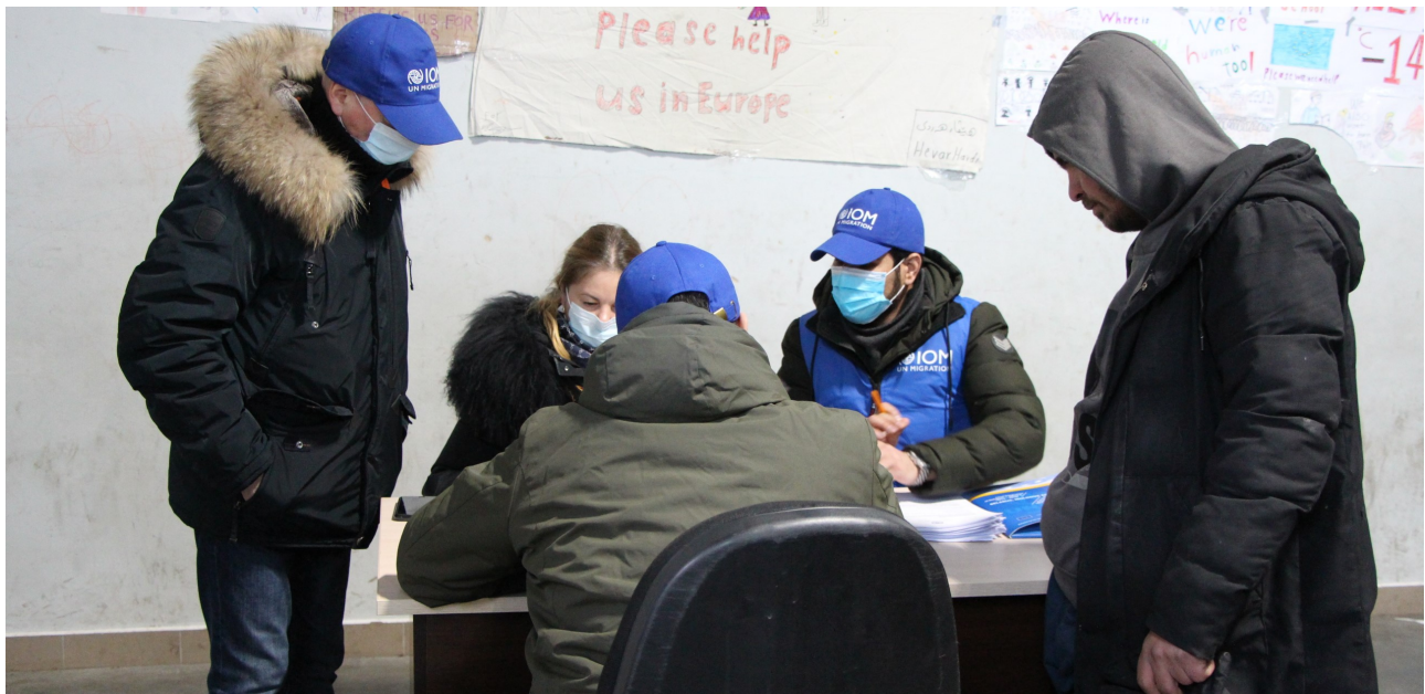
IOM registering people willing to return to their countries of origin into the AVRR programme

Pre-departure assistance at the airport was also provided for all. All migrants departing under the AVRR programme from Minsk are equipped with travel kits observing COVID-19 requirements. These kits include medical masks, sanitizers, and tissues.