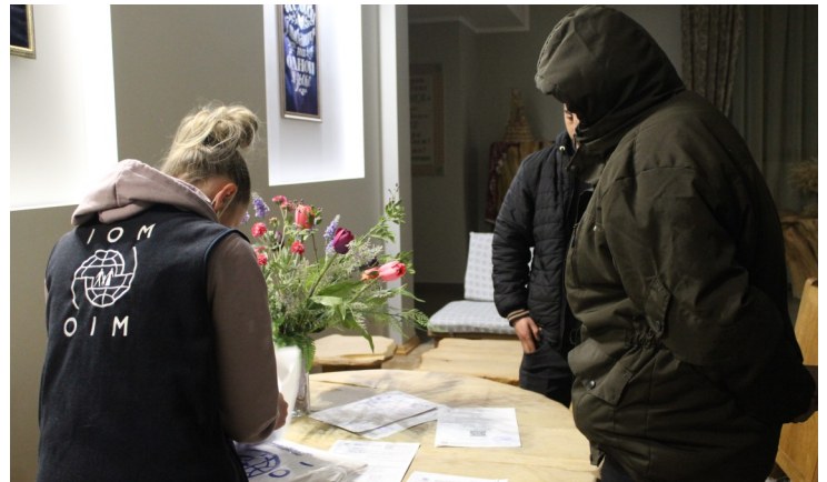
IOM providing pre-departure assistance to migrants accommodated at the hotel near Minsk airport

Non-food items, such as clothing (trousers, shoes) and medicines were provided to the migrants accommodated at the hotel near Minsk airport and awaiting return within AVRR programme. The migrants at the hotel are also provided with hot meals three times a day totalling to approximately 1,000 meals during the week.