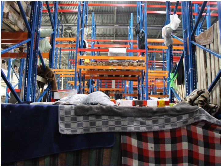
Beds at the logistics facility where migrants are accommodated

First results of the IOM's needs assessment piloted during the first week of January, while not comprehensive, have highlighted urgent needs related to safe shelter, adequate health services, improved sanitary conditions, balanced nutrition, and mental health and psychosocial support (MHPSS). This corresponds to IOM's initial observations while delivering assistance.