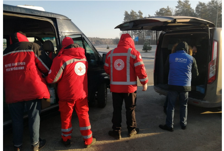
IOM delivering humanitarian assistance which is further distributed among migrants with the help of BRC

During the reporting period, IOM supported migrants stranded at the Belarus-Poland border through the delivery and distribution of humanitarian aid, namely 210kg of bread, 123kg of fruit and 98L of milk for children. Currently, IOM provides humanitarian assistance at the logistics facility once a week, however, possibility of food and NFI delivery to the migrants twice a week is being considered.