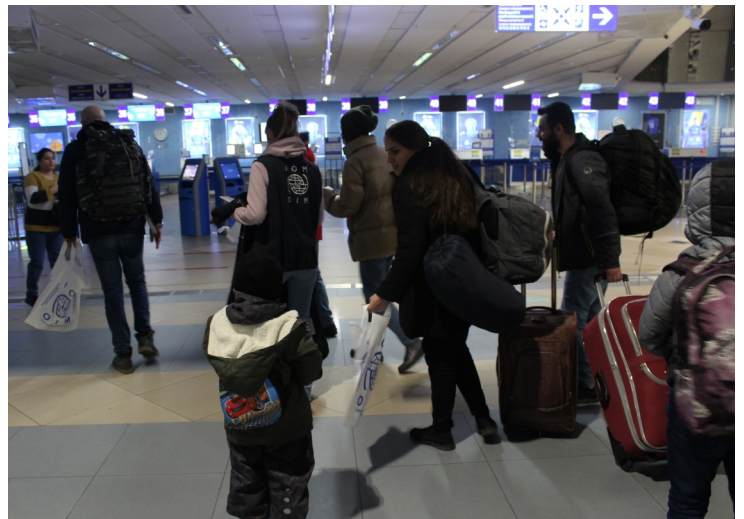
Migrants at Minsk airport before departure to their country of origin

IOM continues to provide its AVRR services (outreach, counseling, and registration) at Minsk airport every day. Between 31 December 2021 and 6 January 2022, a total of 47 people (all Iraqi nationals) departed with IOM support via commercial flights. Pre-embarkation medical checks and PCR testing were conducted to ensure their safe travel.