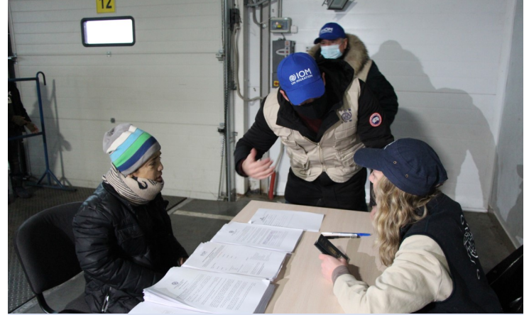
IOM representatives registering a migrant into the AVRR programme

IOM offers AVRR support to migrants to return safely to their countries of origin, as it is one of the few viable support options for migrants wishing to benefit from this opportunity in light of the current impossibility to move onward. During the reporting period, 28 people benefited from the AVRR programme. Among them, 26 people were registered at the logistics facility and will be transported to Minsk on 7 January, and 2 people either approached IOM Belarus themselves or were referred by state authorities. For the people staying at the hotel and awaiting departure, medicines and clothes (2 warm jackets and 2 pairs of boots for children) were provided.