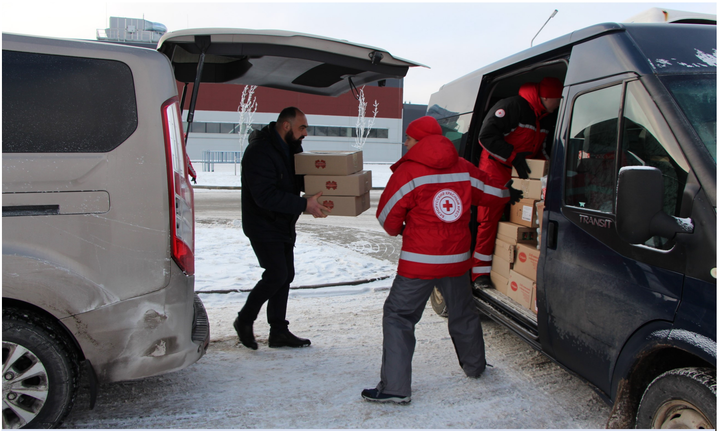
IOM delivering humanitarian assistance which is further distributed among migrants

Two agreements with partner organisations “Belarusian Movement of Medical Workers” (BMMW) and “Belarusian Red Cross” were concluded with the aim to build a partnership on a number of issues to ensure effective and targeted response and viable solutions for the migrants stranded in Belarus. These partner organisations will provide assistance in AVR counselling, delivery of food and NFI, capacity building of the local staff, including referrals to the IOM protection mechanisms.