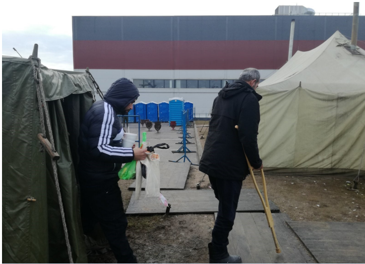
Migrants receiving food assistance delivered by IOM

During the reporting period, IOM continued supporting migrants stranded at the Belarus-Poland border. On 5 January, 210 kg of fresh bread, 67.5 kg of apples, 54.7 kg of bananas, 50L of liquid soap and 50 kg of toilet soap were delivered and distributed among the migrants.