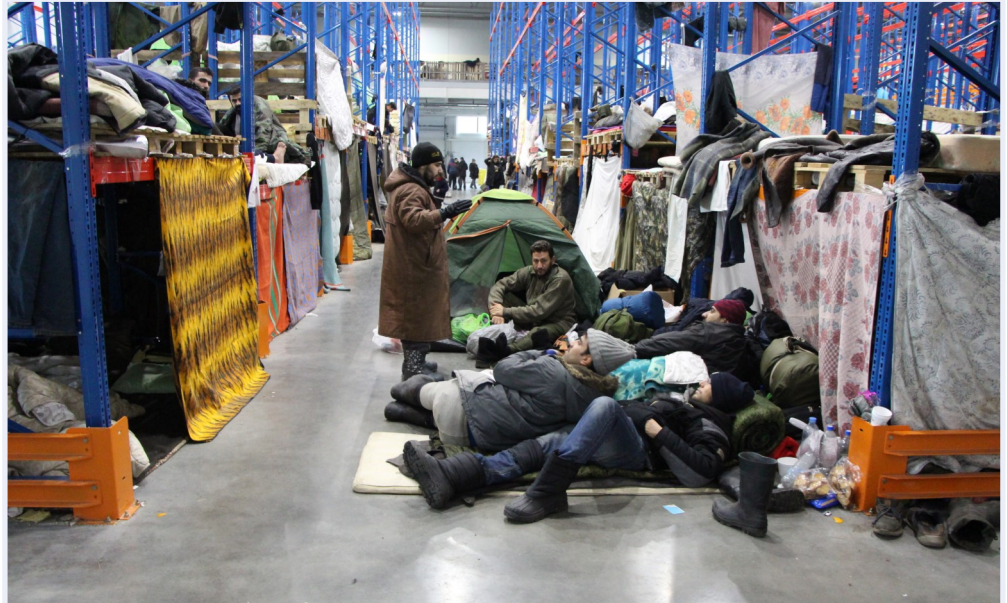
Migrants at the logistics facility near the Belarus-Poland border

47 people departed Belarus for their countries of origin.