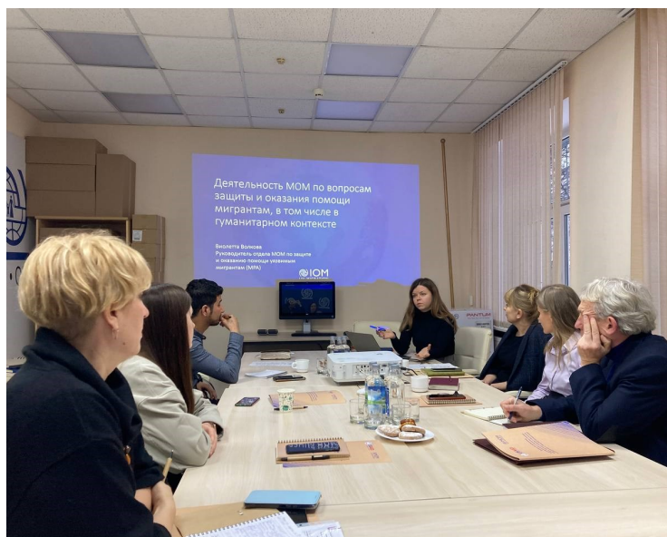
Staff members deepen their knowledge in protection aspects of humanitarian work

On 1 November, IOM attended the monthly meeting of the Refugee Coordination Forum (RCF) led by UNHCR, which serves as platform for the exchange of information and coordination of assistance to refugees from Ukraine in Belarus between the UN agencies, governmental partners and the Belarusian Red Cross. The meeting focused on the practical application of the recently revised Decree of the President envisaging social benefits to Ukrainian refugees, their access to education and medical services. Following the RCF meeting and on request of the participants, a meeting to clarify the revised decree and its provisions was organized on 18 November by the Ministry of Interior with the participation of the Ministry of Education, Ministry of Healthcare and Ministry of Labour and Social Protection.