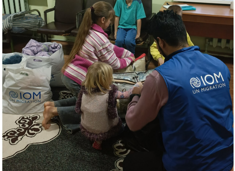
IOM staff delivers household items to

In 2022, IOM Belarus provided voluntary return assistance to a total of 707 migrants .