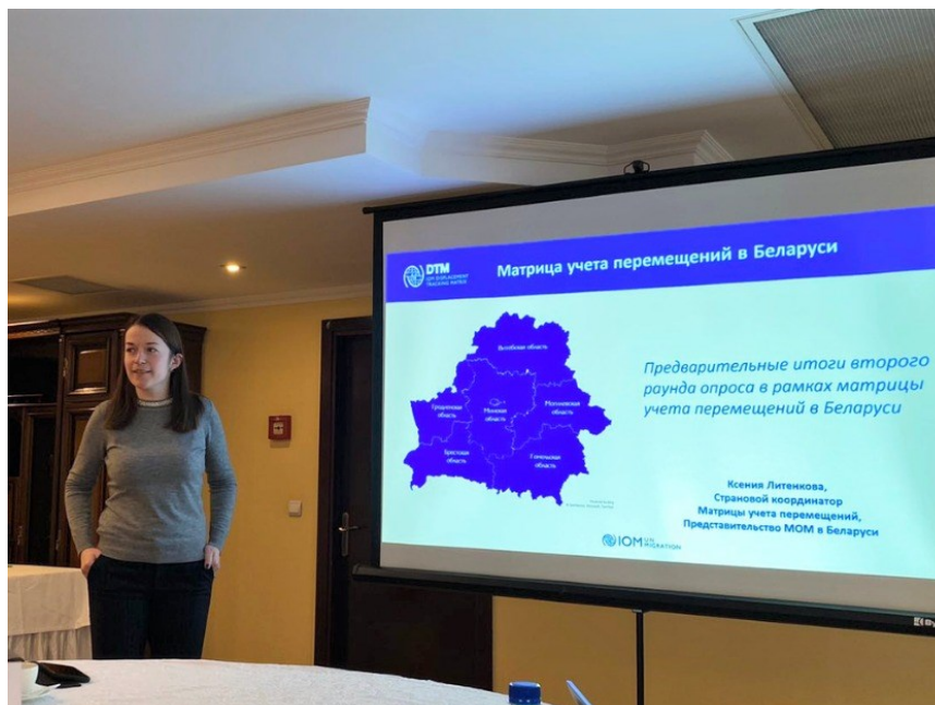
DTM country coordinator presents the preliminary results of the second round of DTM

On 29 November, a roundtable with representatives of state authorities, non-governmental partners and international organizations was organized by BRC to discuss the preliminary results of the DTM data collected in round two. The roundtable participants learned about the profile of the survey respondents, their travel routes and intentions, key needs and challenges of integration in Belarus. Additionally, the next steps and possibilities of using DTM in Belarus more widely to collect and analyze data were discussed. The roundtable participants also exchanged their experiences of providing humanitarian assistance to migrants and refugees from Ukraine in Belarus, noting the successes, challenges and targeted solutions in the continuation of such activities.