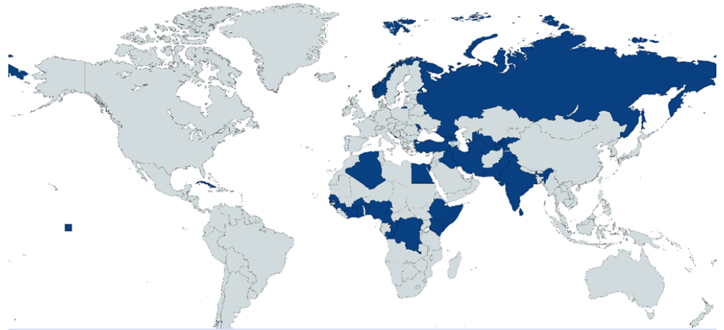
Map of return countries of the AVRR beneficiaries in 2022

In the reporting period, voluntary return assistance was provided to five people. In total, in 2022, IOM Belarus provided assistance with voluntary return to 582 persons – either within the Assisted Voluntary Return and Reintegration (AVRR) programme or through voluntary humanitarian return. The beneficiaries returned to 30 countries of origin, including Iraq, Cuba, Sri-Lanka, Türkiye, Guinea, Nigeria, India, Russian Federation, Cameroon, Egypt, Benin, Senegal, Somalia, Republic of Congo, Democratic Republic of Congo, Ghana, Turkmenistan, Tajikistan, Burkina-Faso, Pakistan, Kyrgyzstan, Moldova, Iran, Algeria, Kenya, Georgia, Norway, Uzbekistan, Ethiopia, Cote d'Ivoire.