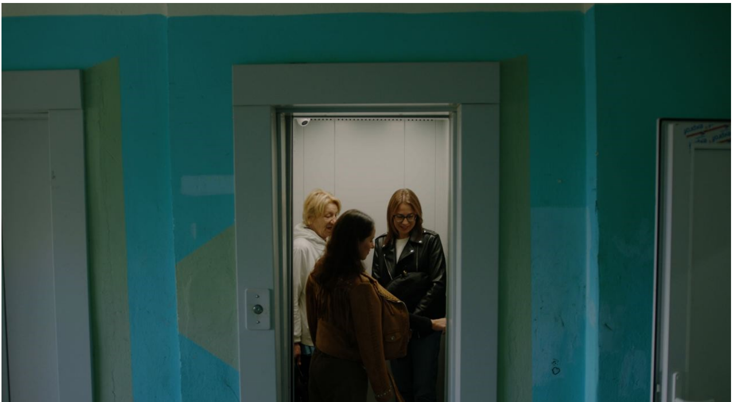
Ukrainian refugee who fled Mariupol welcomes IOM staff in her dormitory in Vitebsk, Belarus

According to the assessments within IOM's DTM report as of 2 July, there are 6,632 Ukrainian refugees and 896 TCNs remaining in the territory of Belarus.