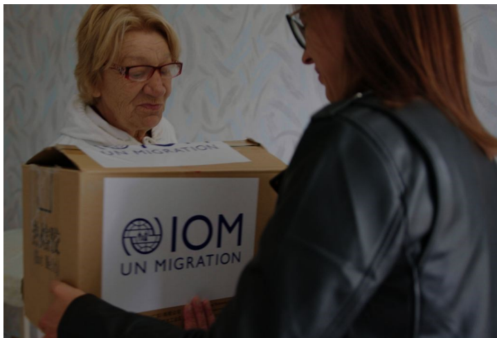
IOM staff hands over a box with household items to the Ukrainian refugee to furnish her dormitory room