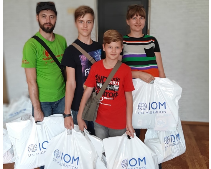
Ukraine nationals who approached IOM project site in Vitebsk received food and hygiene kits

The IOM-supported hotline on safe migration and combatting human trafficking received over 776 requests (27.2% of the total number of queries) from refugees and TCNs fleeing Ukraine since 24 February concerning migration issues and the assistance available in Belarus.