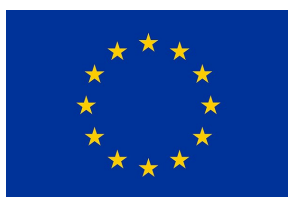
Funded by the European Union