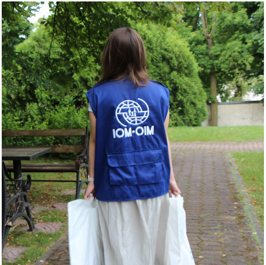
IOM staff brings bags with food and hygiene items to refugees from Ukraine

In total, as of 22 July, IOM Belarus has provided AVRR support to 573 migrants (402 males and 171 females), including 134 children, in 2022. Migrants returned to the following countries: Iraq, Cuba, Sri Lanka, Guinea, Nigeria, Republic of Türkiye, Ghana, Egypt, India, the Russian Federation, Cameroon, Somalia, Republic of Congo, Turkmenistan, Tajikistan, Pakistan, Democratic Republic of Congo, Burkina-Faso, Kyrgyzstan, Moldova, Iran, Kenya, Algeria, Georgia, Norway, Benin, Uzbekistan, Ethiopia and Côte d'Ivoire.