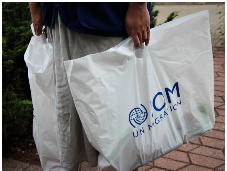
Bags with food and hygiene items provided to people fleeing Ukraine

In addition to the Ukrainian response, assistance is provided on a permanent basis to other migrants, mainly those approaching IOM for consultations and with requests for voluntary return to their countries of origin. Those who do not have shelter are accommodated in a hotel or hostel. Hot meals are provided to an average of 20 migrants accommodated in the hotel every week. Migrants who accept IOM support in the hostel are provided with food and hygiene kits on a regular basis, as well.