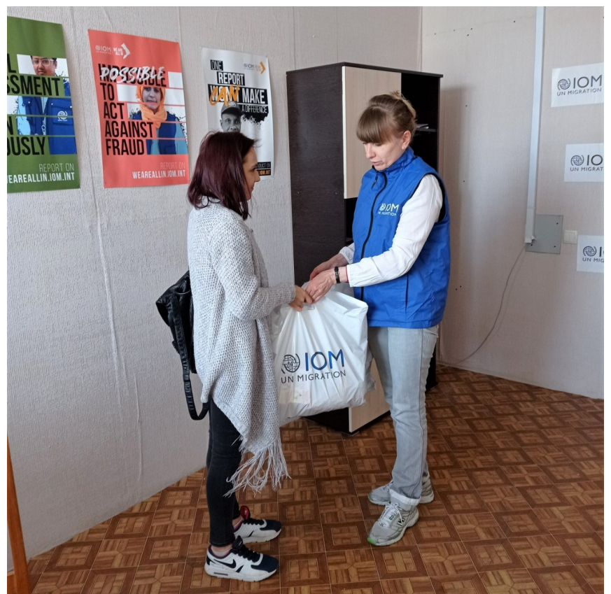
IOM staff in Gomel hands over a bag with food items to the Ukrainian refugee

While there have been gaps in the data, particularly on where arrivals stay in Belarus and on their needs, these gaps are now being addressed with the roll out of IOM's DTM methodology in partnership with the Belarusian Red Cross (BRC). Improved data collection and analysis will allow for a stronger evidence base for humanitarian actors to respond to the needs of these arrivals. The first preliminary report is being drafted and expected to be ready in the coming week.