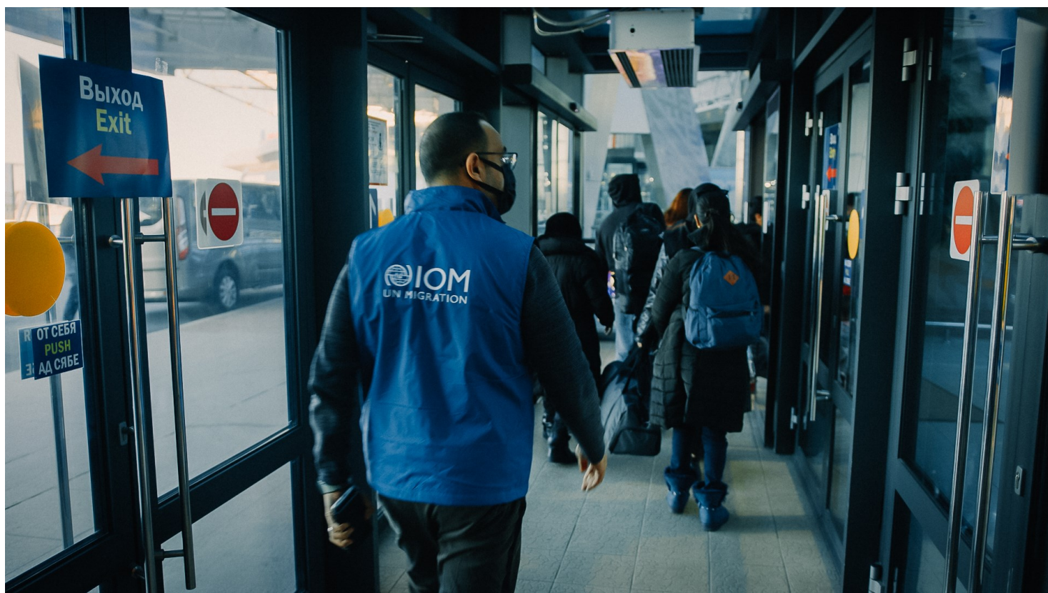
IOM personnel accompany AVRR beneficiaries at the airport before their departure

As of 7 July, IOM Belarus has provided AVRR support to 547 migrants (387 males and 160 females), including 132 children, in 2022. The number of Iraqi beneficiaries has been decreasing recently but still accounts for the highest share of the returnees (73 per cent). At the same time, there has been an increase in the number of Cuban nationals contacting IOM for voluntary return assistance (10 per cent). Other countries of origin of migrants returning through the AVRR programme include Sri Lanka, Guinea, Nigeria, Republic of Türkiye, Ghana, Egypt, India, the Russian Federation, Cameroon, Somalia, Republic of Congo, Turkmenistan, Tajikistan, Pakistan, Democratic Republic of Congo, Burkina-Faso, Kyrgyzstan, Moldova, Iran, Kenya, Algeria, Georgia, Norway, Benin and Uzbekistan.