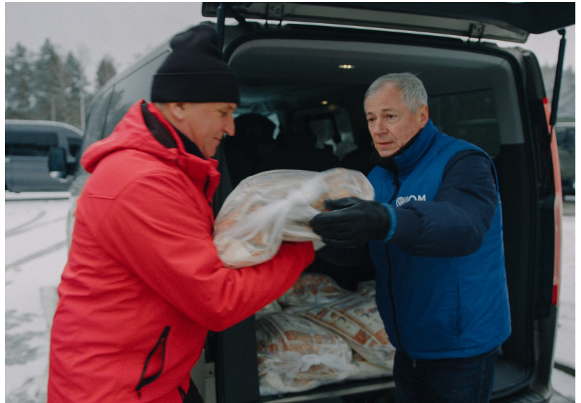
IOM delivering pitta bread to the logistics facility

In the reporting period, IOM delivered and distributed 795kg of pitta bread, 235kg of bananas, 179kg of apples, 91kg of oranges, and 86kg of soap. In addition, 200 lice treatment sprays were delivered and distributed among the migrants.