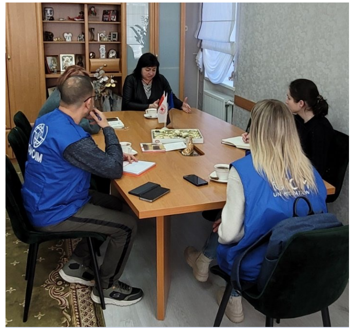
IOM representatives meeting with Gomel branch of BRC