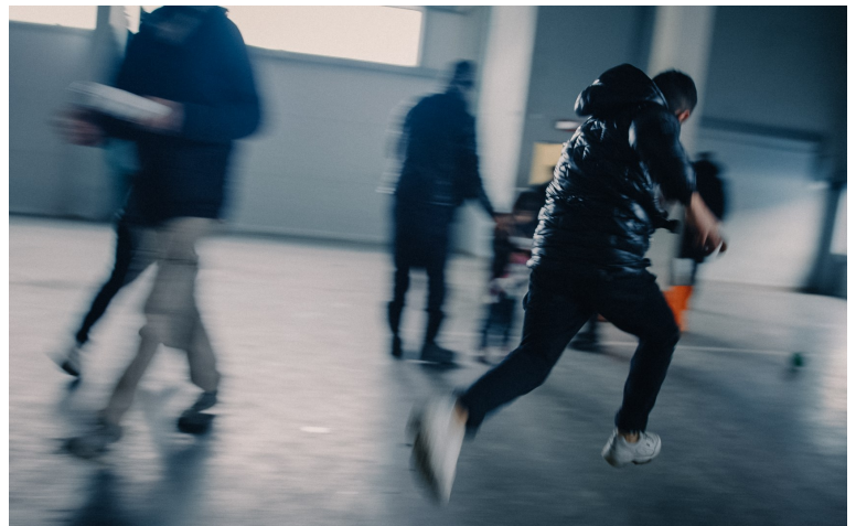
Children playing in the logistics centre