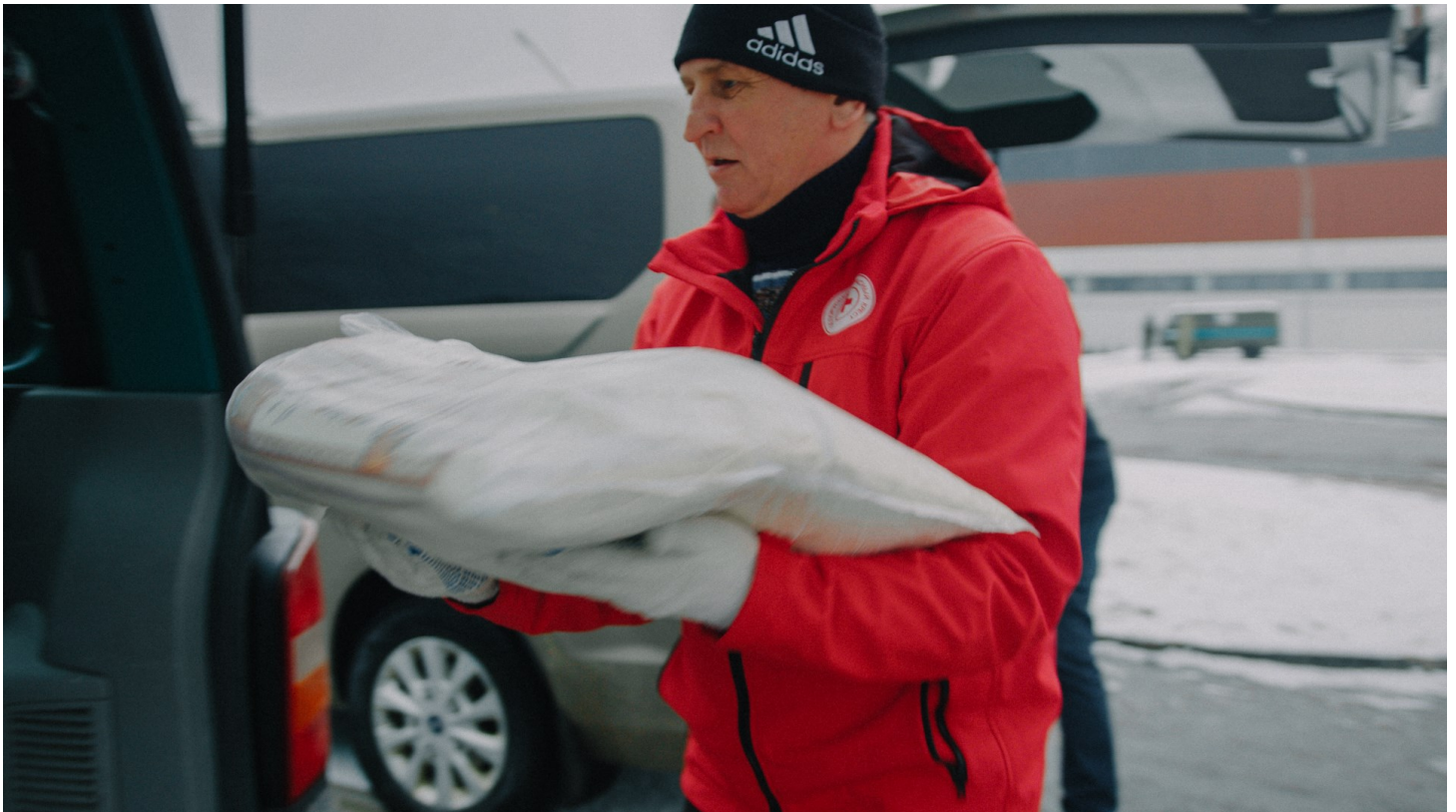
Belarusian Red Cross delivering humanitarian aid to migrants in Bruzgi logistics centre

Hygiene kits (toilet paper, shampoo, wet wipes, and toothpaste) and food items (pasta, bottled water, biscuits, nuts, fruit puree, and milk for children) for migrants at the logistics centre were procured and distributed by the BRC. A training session on psychosocial support was held by BRC for fifteen staff members and volunteers working in the logistics centre. An additional training on the same topic is planned for the next reporting period.