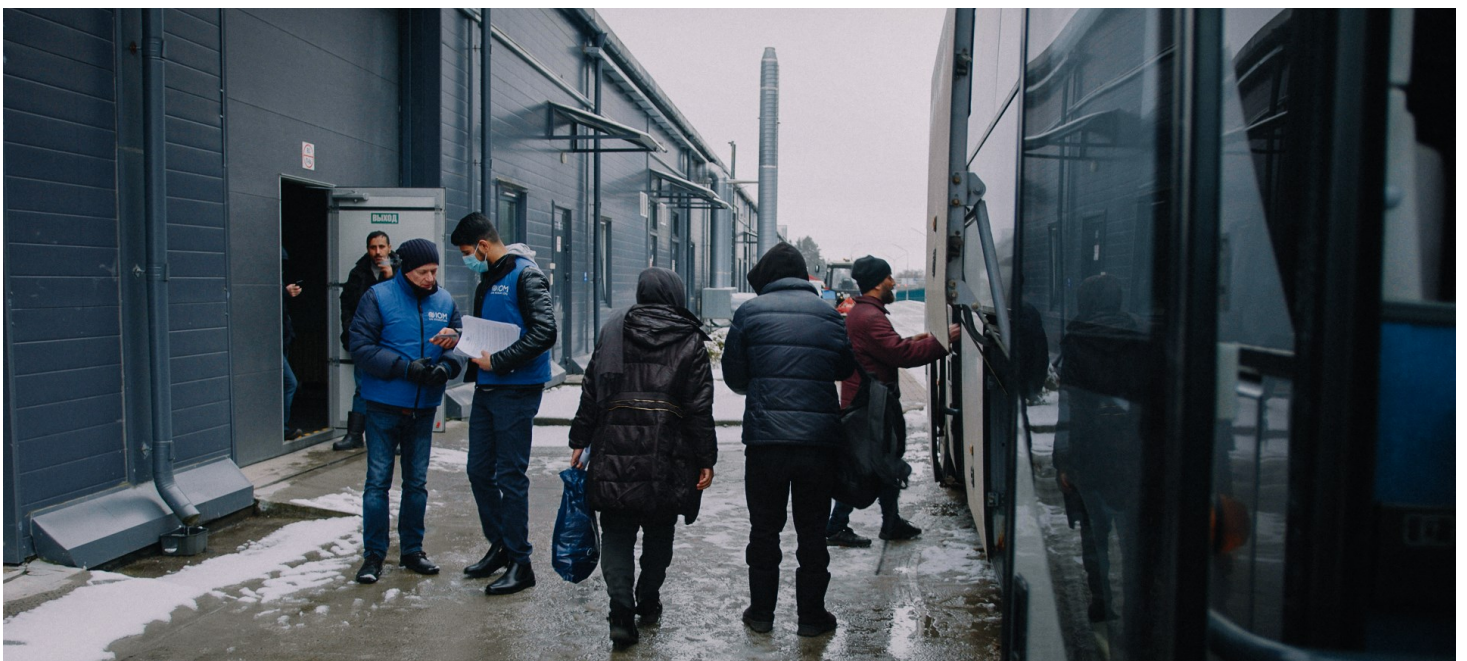
People getting on the bus taking them from Bruzgi logistics centre to the hotel in Minsk

The demand for AVRR is still high among both migrants accommodated at the logistics facility and urban migrants. Thirty-five AVRR beneficiaries were transported from Bruzgi to Minsk , where they are awaiting their departure. In total, 128 migrants are currently staying at the hotel in Minsk.