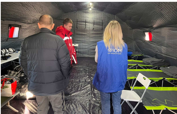
IOM representatives visiting the tents installed by the BRC to provide assistance to refugees and migrants from Ukraine

As security in the region deteriorates and grows increasingly unpredictable, more people accommodated at the logistics facility are expressing their willingness to return to their countries of origin.