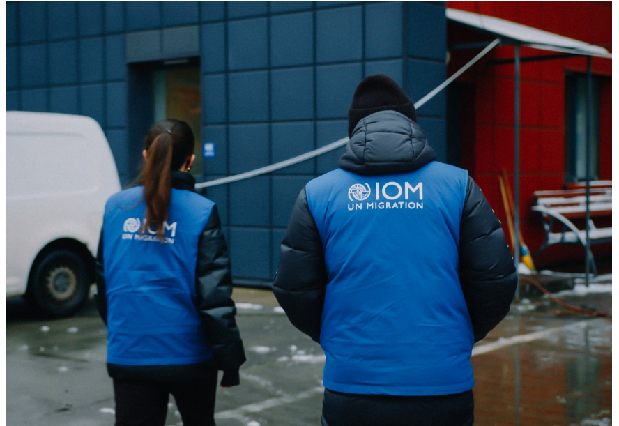
IOM Belarus staff entering the Bruzgi logistics facility where over 400 migrants are accommodated

1,300kg of food and 86kg of hygiene items were distributed among migrants at the logistics facility in the reporting period.