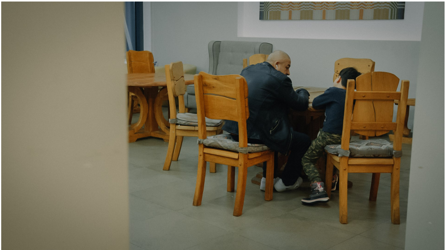
A family admitted to the AVRR program staying at the hotel in Minsk before their departure to the country of origin

IOM provides meals three times a day to an average of 124 AVRR beneficiaries staying at the hotel in Minsk and awaiting departure to countries of origins. The migrants were also provided with hygiene items and clothing (jackets, sweaters, shoes).