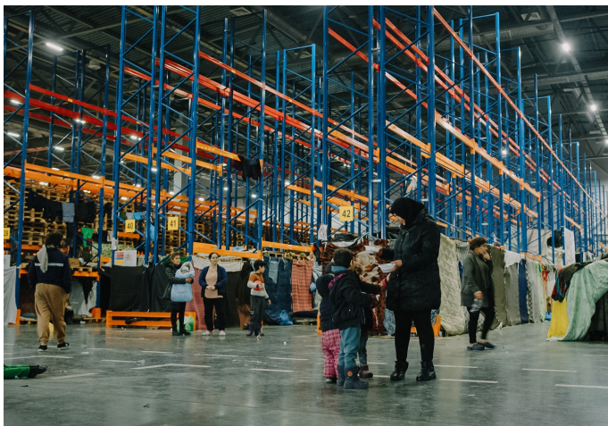
Migrants accommodated in the logistics centre

IOM continues to carry out a humanitarian response based on the migrants' needs assessment. In response to their changing needs, IOM's current response activities include medical support, food items, NFIs, and AVRR.