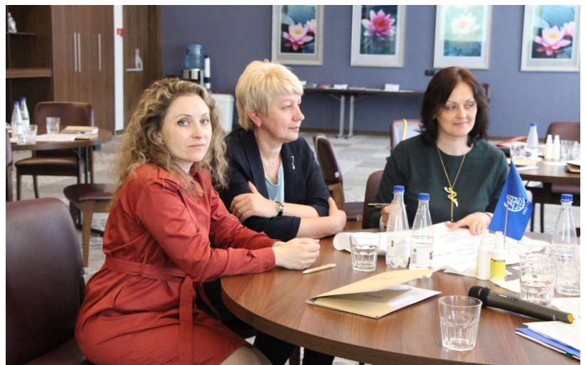
Participants of the MDG meeting for Brest region

On 4 May, within the framework of the multidisciplinary group (MDG) meeting for Brest region – an integral part of the National Referral Mechanism (NRM) for the protection of vulnerable migrants - IOM Belarus sensitized key country counter-trafficking stakeholders on the issue of unaccompanied migrant children , including those fleeing Ukraine, who do not wish to claim refugee status and are not covered by the Belarus legislation. This is a step towards building momentum for strengthening the national migrant protection and anti-trafficking framework following the Best Interests of the Child approach. In late April, the first MDG meeting in 2022 was held in Minsk with UNICEF and UNHCR joining. IOM will be further advocating for this issue within the platforms of other MDG meetings to be held in all remaining regions of Belarus across May-June 2022.