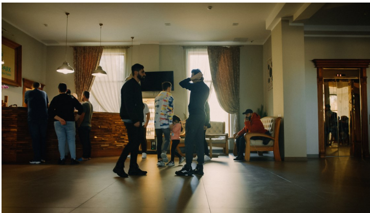
AVRR beneficiaries at the hotel near Minsk Airport

One returnee to Ghana was assisted with the receipt of a travel document from the relevant Embassy.