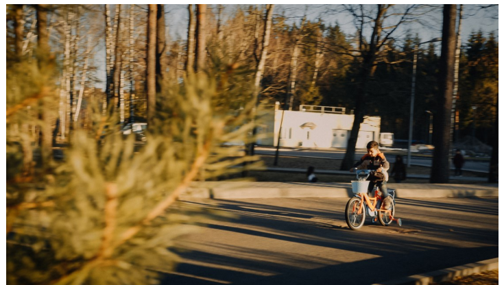
Child riding a bicycle in front of the hotel near Minsk Airport