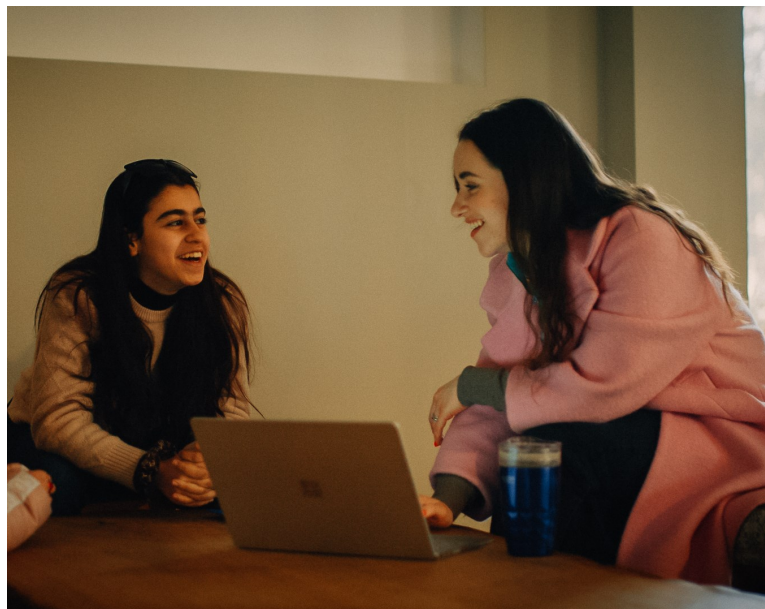
IOM staff talking to the beneficiary of the AVRR programme accommodated at the hotel in Minsk

Temporary accommodation in sanatoriums for Ukrainian refugees were emptied by Belarusian authorities, causing people to find shelter solutions on their own.