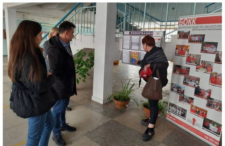
IOM staff during the visit to Brest region on 25-26 April

From 25-26 April, IOM staff visited Brest region to assess the number of migrants and refugees arriving from Ukraine and identify their needs. IOM representatives met with local NGO partners, including the Brest branch of the Belarusian Red Cross, the Brest branch of the Belarusian Movement of Medical Workers (BMMW), and the Business Women Club. Thirty-two Ukrainian refugees, including nine children, are currently accommodated in a dormitory in Brest. According to the Brest branch of the BRC, 300 people fleeing the war in Ukraine requested assistance from the BRC and were provided with hygiene kits and food items. The BRC also covers temporary accommodation fees in the dormitory for people in need of shelter.