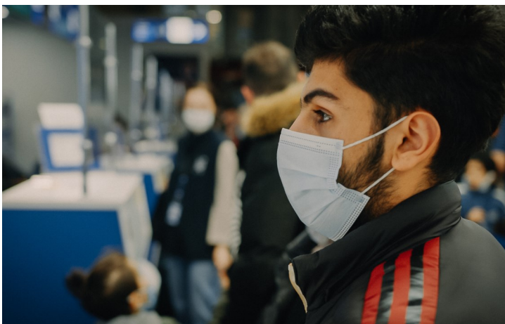
AVRR beneficiary checking in for the flight

As of 28 April, IOM Belarus has provided AVRR support to 467 migrants (326 males and 141 females), including 122 children, in 2022. Most of the returnees were Iraqi nationals (82 per cent), while other AVRR beneficiaries have returned to Cuba (4.5 per cent), Sri-Lanka (2.5 per cent), Turkey, Guinea, Nigeria, India, Russia, Cameroon, Egypt, Somalia, Republic of the Congo, Ghana, Democratic Republic of the Congo, Turkmenistan, Burkina-Faso, Pakistan, Kyrgyzstan, Moldova, Iran, and Algeria. Within the reporting period, one national of Pakistan had a significant medical condition and was provided with a medical escort.