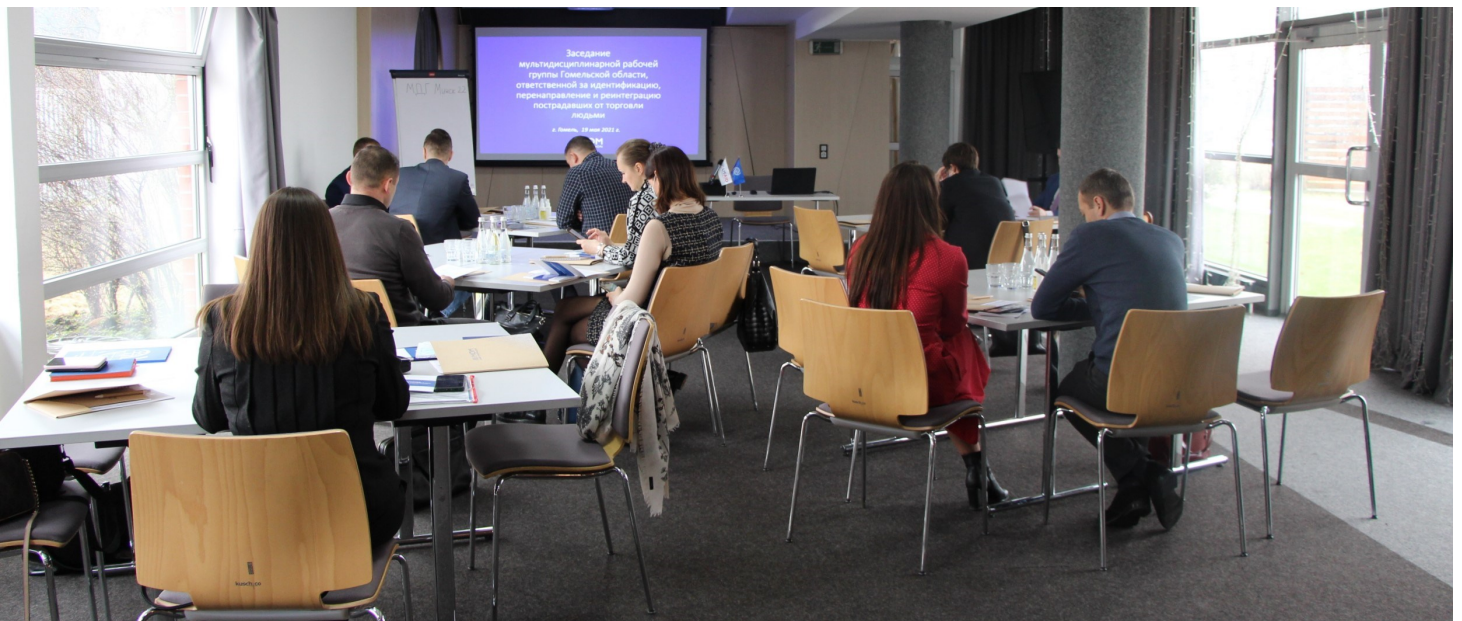
Multidisciplinary group meeting held in Minsk on 19 April

On 19 April, within the framework of the multidisciplinary group (MDG) meeting for the Minsk region – an integral part of the national referral mechanism for victims of human trafficking – IOM Belarus sensitized key country counter-trafficking stakeholders on the issue of unaccompanied migrant children , including those fleeing Ukraine who do not wish to claim refugee status and are not covered by Belarus' legislation. This is a step towards building momentum for strengthening the national migrant protection and anti-trafficking framework following the Best Interests of the Child approach. IOM will continue to discuss this issue further during upcoming MDG meetings across all regions of Belarus from April-June.