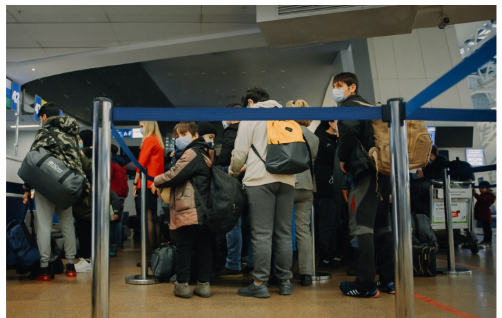
AVRR beneficiaries lining up for the check-in prior to the flight