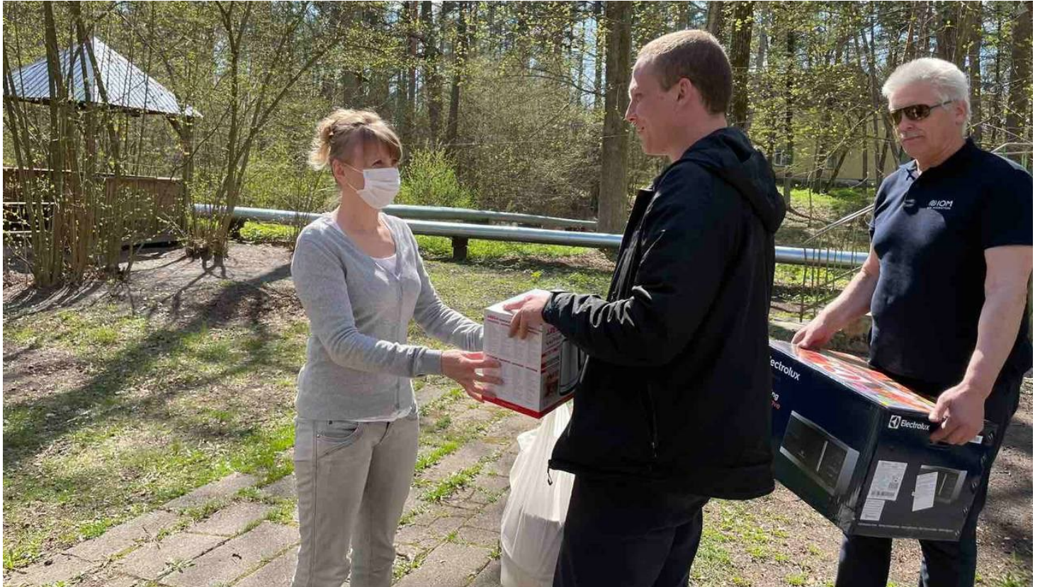
IOM representatives handing over a kitchen set to a Ukrainian family in Gomel

IOM's project site in Gomel continues functioning to ensure a prompt and targeted response to assist people fleeing Ukraine and to efficiently coordinate response activities with local partners. On 28 April, a kitchen set , consisting of a microwave, kettle and other small household items, was procured and handed over to a Ukrainian family.