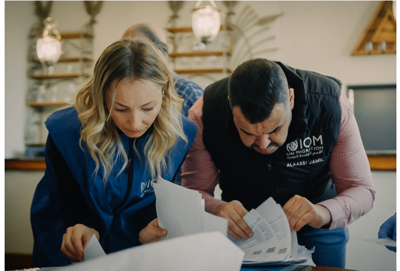
IOM staff checking PCR tests of the AVRR programme beneficiaries

The IOM-supported hotline on safe migration and combatting human trafficking received 198 requests for information on entry to, transit through, exit from Belarus from Ukrainian refugees and third country nationals fleeing the war in Ukraine since 24 February.