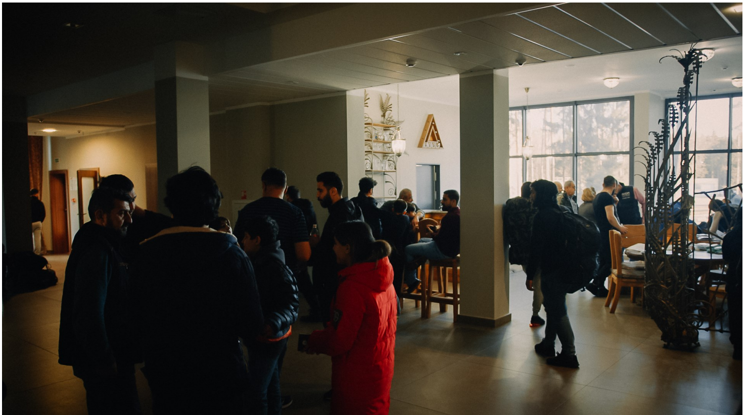
AVRR beneficiaries accommodated at the hotel prior to their departure home

People who have registered for AVRR and are awaiting departure are accommodated either in a hotel or in a hostel in Minsk and are provided with three meals a day . On average, 25 migrants receive accommodation per week. During the reporting period, IOM distributed 417kg of food , including fresh fruits and vegetables, cereals, and canned meat, and 20kg of hygiene items , including shampoos, soaps, and washing powder, to the migrants registered for AVRR.