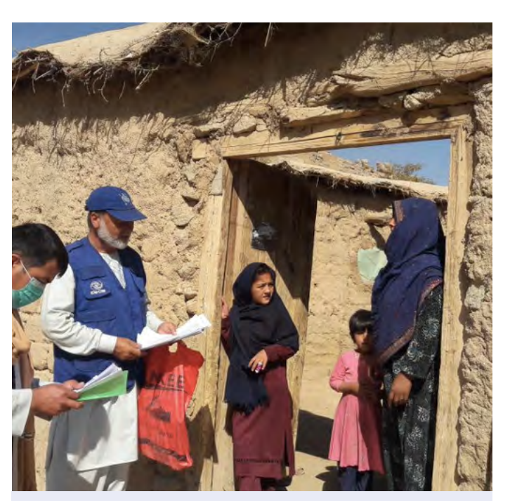
Winterization assessment in Daikundi

21 provinces are currently being assessed for winterization needs to inform future distributions of emergency winter kits such as coats, heating material and stoves to people in need.