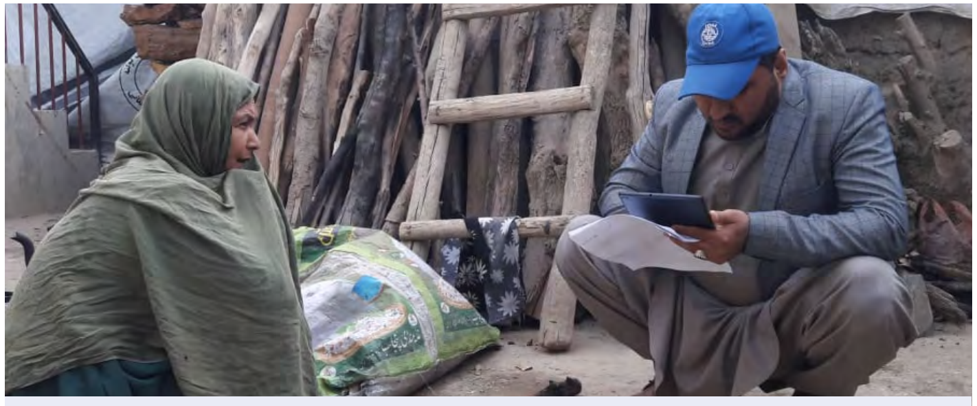
Winterization assessment in Parwan province