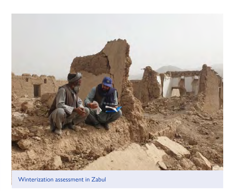
Since 15 August

Undocumented migrants reached with humanitarian assistance at the borders