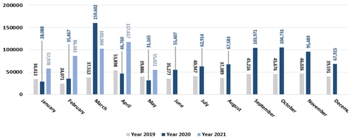
Return of Undocumented Afghans from Iran - 2019 - 2021

334 (96%) Assisted (200 men and 134 women)