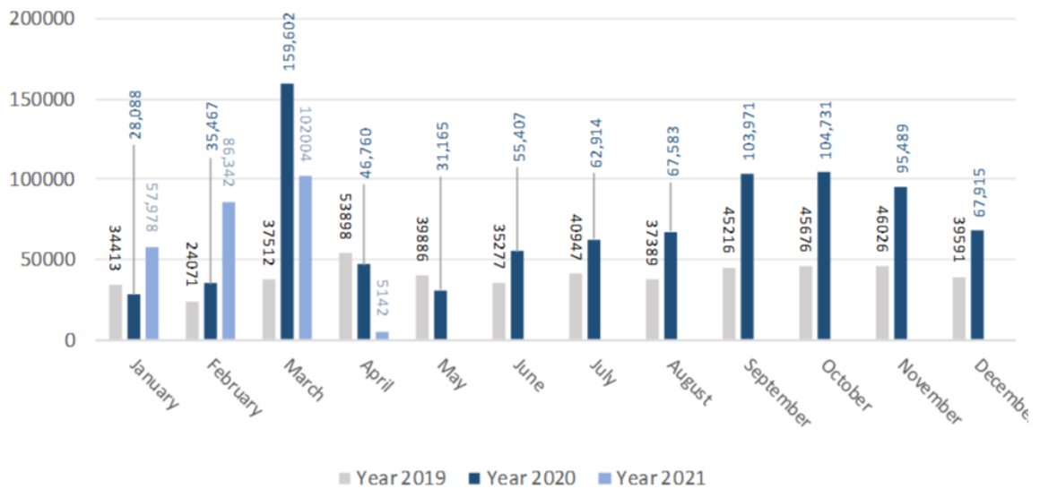
Return of Undocumented Afghans from Iran - 2019 - 2021

*returns have now resumed regular patterns post-Nawroz New Year holidays in Iran/Afghanistan